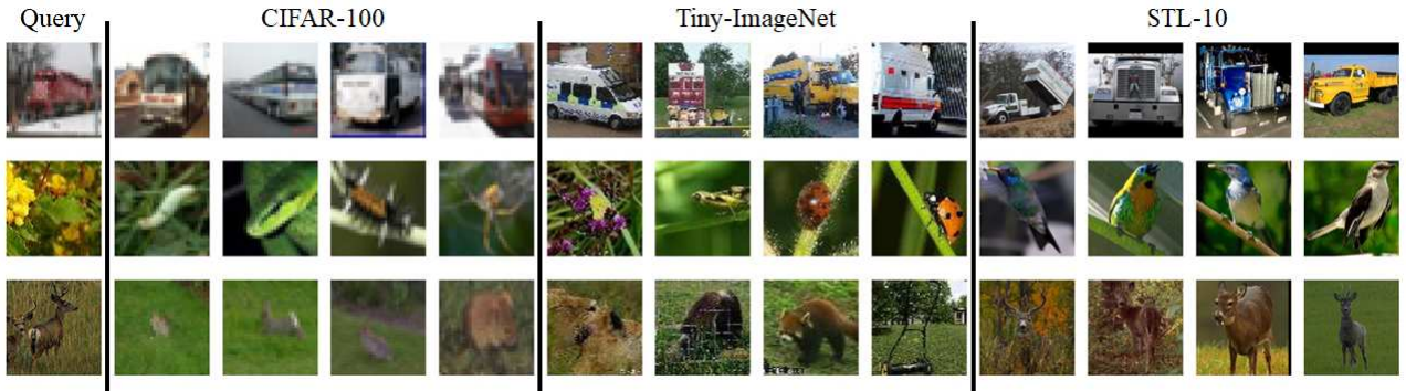
Figure 3. Sampled images from each task (dataset) which have the similar model distribution to that of the query images (first column). The query images belong to CIFAR-100, Tiny-ImageNet, and STL-10 from top to bottom, respectively.

have also introduced a sampling-based optimization strategy to address the discrete action space of the potential candidate models. The proposed approach is learned in a single framework without introducing many additional parameters and much training efforts. The proposed approach has been evaluated on several problems including multi-task learning and network compression. The results have shown the outstanding performance of the proposed method compared to other competitors.