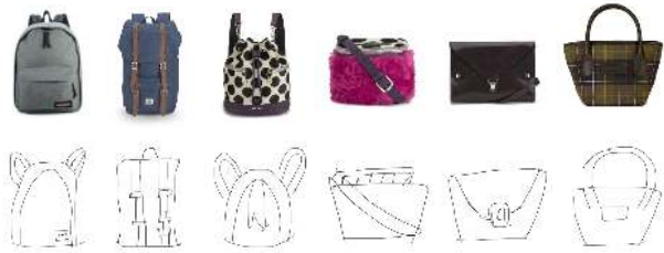
Figure 3. Examples of newly collected Handbag dataset.

where \mathbf{M} is a learnable matrix. Compare Mahalanobis distance to the proposed distance in Eq. 6, it is clear that although both are 2nd order, there is a vital difference: In Mahalanobis distance, one first computes the element-wise subtraction \mathbf{x} - \mathbf{y} and then the 2nd order bilinear product of the difference vectors. In other words, elements of different positions in the two vectors are not directly compared. It is thus not suitable for dealing with fine-grained feature misalignment and using correlation to compensate for noise in the sketch and photo feature vectors.