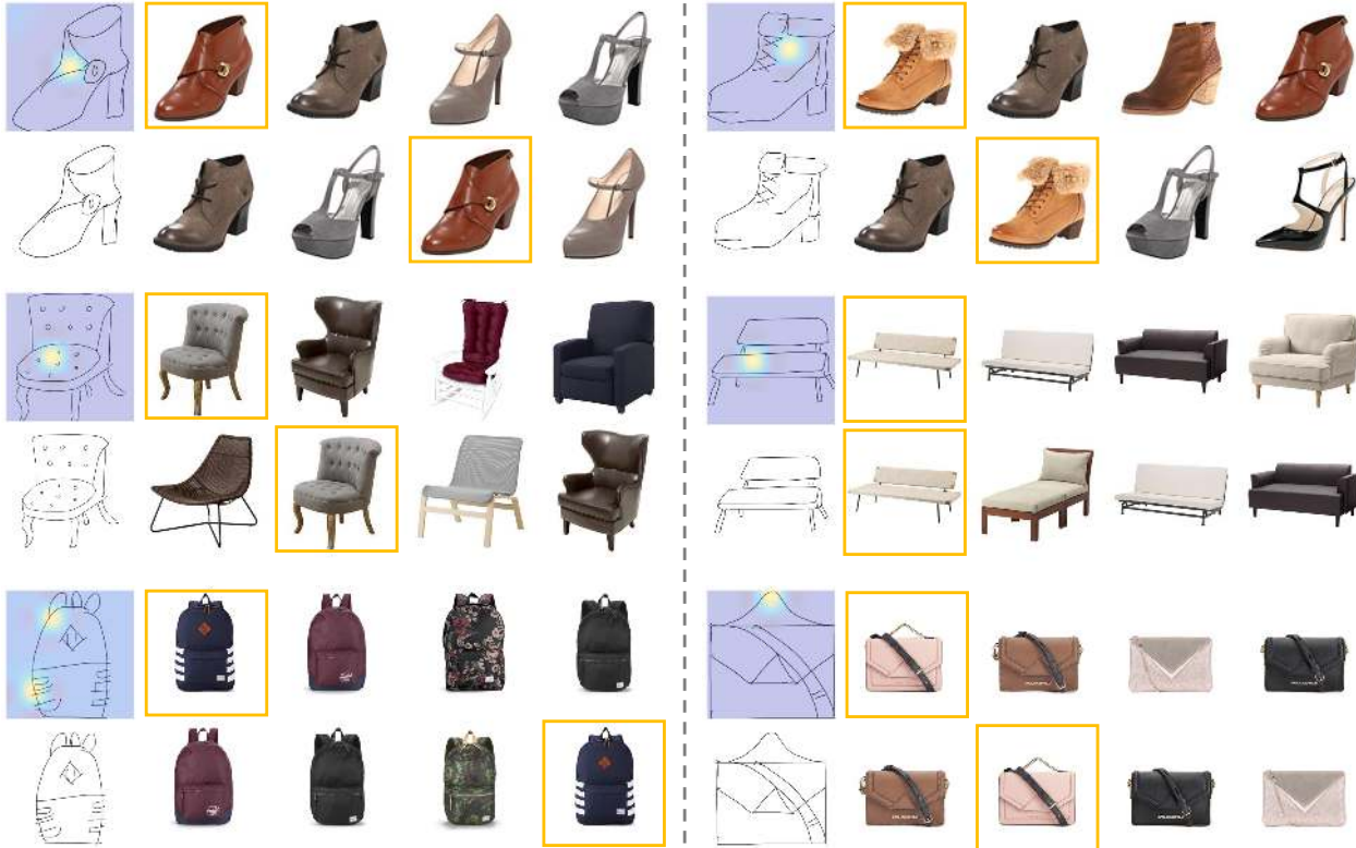
Figure 5. Comparison of the retrieval results of our model and Triplet SN [46]. For each example, the top row is our retrieval result with attention mask superimposed on the query sketch, and the bottom row is retrieval result of the same sketch using Triplet SN.

shown in Table 5. It can be seen that: (1) The proposed 2nd order outer subtraction based HOLEF loss is the best. (2) Even with learnable weights, both weighted Euclidean and Mahalanobis distance in most cases cannot beat the conventional triplet loss with Euclidean distance. (3) Even with a 2nd order energy function, the bilinear product of element-wise subtraction used in Mahalanobis distance is ineffective at dealing with the noise and feature misalignment of the two domains.