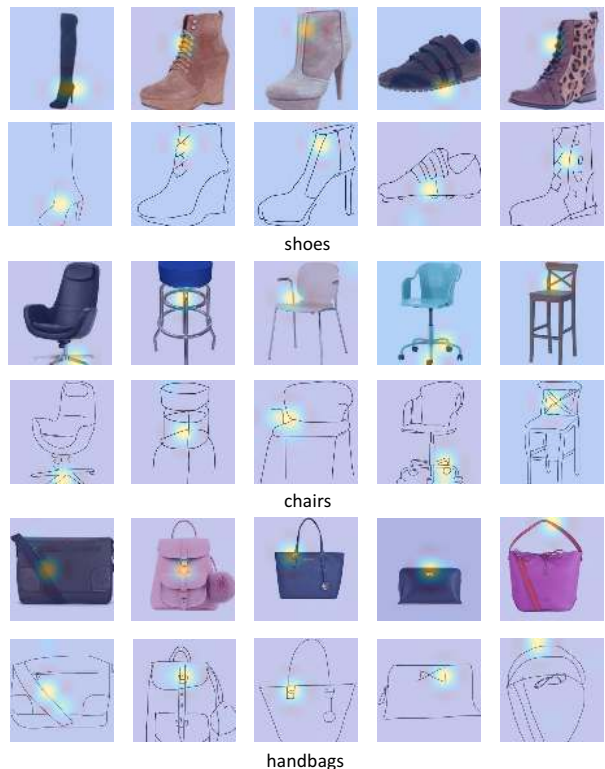
Figure 4. Visualisation of attention masks of sample photo-sketch pairs in all three categories.

validate the effectiveness of our HOLEF loss, we compare with: (i) conventional triplet loss with Euclidean distance, (ii) triplet loss with weighted Euclidean distance, and (iii) triplet loss with Mahalanobis distance. The first two are first order whilst the third is second order. The last two have learnable weights while the first does not. All models have the same base network and attention model as well as CFF. They thus differ only in the loss used. The results are