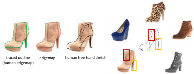
Figure 1. FG-SBIR is challenging due to the misalignment of the domains (left) and subtle local appearance differences between a true match photo and a visually similar incorrect match (right).

With the proliferation of touch-screen devices, a number of sketch-based computer vision problems have attracted increasing attention, including sketch recognition [47, 36, 3, 32], sketch-based image retrieval [46, 24, 10], sketch-based 3D model retrieval [39], and forensic sketch analysis [14, 28]. Among them, using a sketch to retrieve a specific object instance, or fine-grained sketch-based image retrieval (FG-SBIR) [15, 46, 31] is of particular interest due to its potential in commercial applications such as searching online product catalogues for shoes, furniture, and hand-