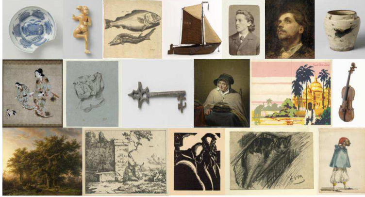
Fig. 1: A visualization of the images that are used for our experiments. It is possible to see how the samples range from images representing plates made of porcelain to violins, and from Japanese artworks to a more simple picture of a key.

Our second approach is generally known as fine tuning and differs from the previous one by the fact that together with the final softmax output the entire DCNN is trained as well. This means that unlike the off the shelf approach, the entirety of the neural architecture gets “unfrozen” and is optimized during training. The potential benefit of this approach lies in the fact that the DCNNs are independently trained on samples coming from the artistic datasets, and thus their classification predictions are not restricted by what they have previously learned on the ImageNet dataset only. Evidently, such an approach is computationally more demanding.