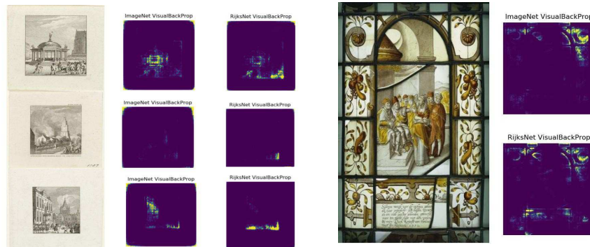
Fig. 4: A visualization that shows the differences between which sets of pixels in an image are considered informative for a DCNN which is only pre-trained on ImageNet, compared to the same architecture which has also been fine tuned on the Rijksmuseum collection. It is clear how the latter neural network develops novel selective attention mechanisms over the original image.

third images), or even to non informative pixels at all, as shown by the second image. However, the fine tuned DCNN shows how these saliency maps change towards the set of pixels that correspond to the portions of the images representing people in the bottom, suggesting that this is what allows the DCNN to appropriately recognize the artist. Similarly, on the right side of the figure we report which parts of the original image are the most useful ones when it comes to classify the type of the reported heritage object, which in this case corresponds to a glass wall of a church. We can see how the pre-trained architecture only identifies as representative pixels the right area above the arch, which turned out to be not informative enough for properly classifying this sample of the Rijksmuseum dataset. However, once the DCNN gets fine tuned we clearly see how in addition to the previously highlighted area a new saliency map occurs on the image, corresponding to the text description below the represented scene. It turns out that the presence of text is a common element below the images that represent clerical glass windows and as a consequence it is recognized by the fine tuned DCNN as a representative feature.