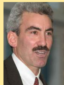
George Loewenstein is the Herbert A. Simon Professor of Economics and Psychology, Carnegie Mellon University.