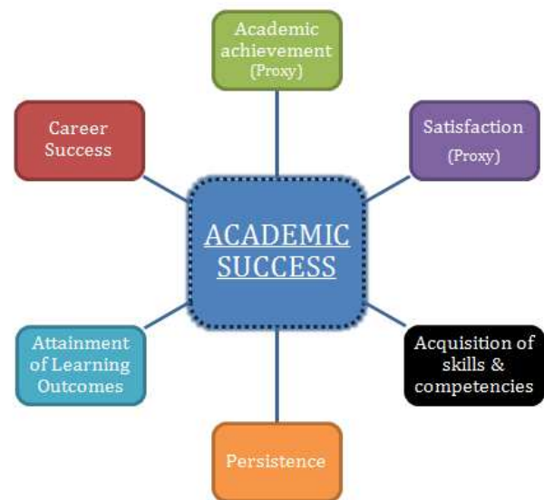
Figure 2. York, Gibson, & Rankin Revised Conceptual Model of Academic Success

A revised definition and model. It is with this critique in mind that we present an amended definition and conceptual model of academic success (Figure 2). Based on our findings we define academic success as inclusive of academic achievement, attainment of learning objectives, acquisition of desired skills and competencies, satisfaction, persistence, and post-college performance.