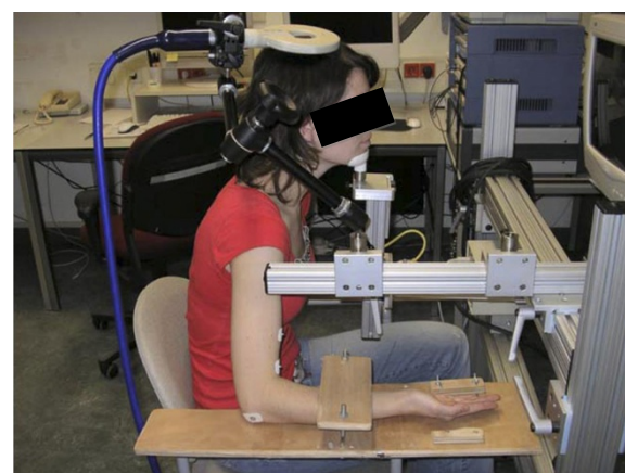
Figure 1 Position of the participant in a chair with the right arm placed in a fixed frame and a circular coil placed above the vertex. Written informed consent for publication of the image was obtained from the patient.

Participants were comfortably seated in a chair with their right forearm and hand supinated and supported by a custom built device (Figure 1). The elbow was positioned in 90 degrees flexion. The device restricted any movement of the upper arm, forearm, wrist, and fingers. Bipolar EMG-recordings were obtained using 2 pairs of self-adhesive surface electrodes (Ag-AgCl, solid gel, foam electrodes (35 × 22 millimeters)) placed in a standard tendon belly montage. EMG-signals were recorded using a CED (Cambridge Electronic Design Ltd) data acquisition and amplifier system with a bandpass filter of 20 to 3000 Hz at a display sensitivity of 0.5 microvolt/division (amplifier range 100 millivolt), using a recording