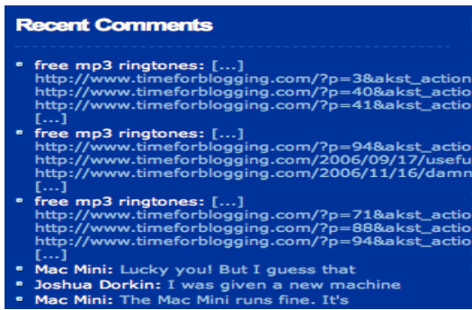
Figure 2. Example of spam 2.0 in comment system