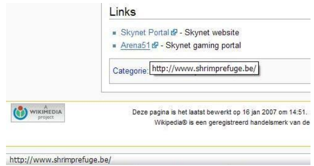
Figure 4. Examples of spam 2.0 in Wikipedia. The source of the citation link has been manipulated by spammers to the different source.

Wikis provide broader level of content contributions to web users. Inside wikis users can create/modify any number of webpages. However spammers are not omitted from such lists. They infiltrate wiki webpages with unrelated materials such as links or citation for content of the page. Particularly spammers try to spread out their link in wiki pages for search engine ranking rather than attracting users. Figure 4 shows examples of spam 2.0 in Wikipedia. The source of the citation link has been manipulated by spammers to the different source.