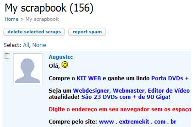
Figure 5. Example of spam 2.0 in an online community

Social bookmarking website where user can share videos and contribute to others submitted video, online communities where users can make a virtual identity and communicate with others, etc are few example of social networking platforms. Social networking platform provide different facilities for content sharing and communication Such as private and public messaging, comment system, interests, etc. However each of such facilities (Table 1) can be compromised by spammers to host spam like creating fake user profiles, sending private spam message, spam commenting on users profile, posting unsolicited videos, making promotional links etc. Hence such platform has more risk of being infiltrated by spam 2.0 and much harder to manage. Figure 5 shows an example of spam 2.0 in an online community. Spam 2.0 hosted on genuine user profile as a kind of comment.