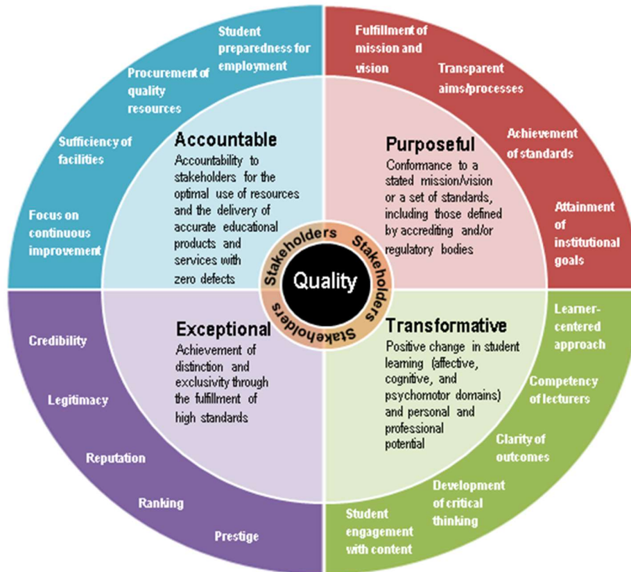
Figure 1. Conceptual model of quality depicting broad and specific strategies for defining quality.

exceptional, and accountable). The outer portion of the model contains examples of quality indicators that could be used to assess each of the broad conceptualizations. In summary, the model depicts the importance of a multifaceted approach to defining quality, which requires eliciting stakeholder perspectives to develop a broad conceptualization of quality and to accurately select specific indicators to measure that conceptualization of quality.