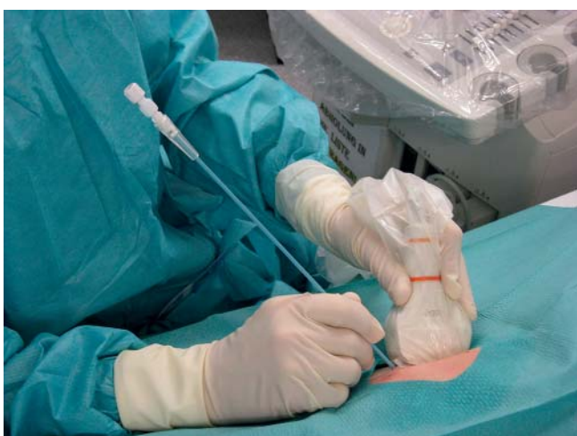
► Fig. 4 Placement of an abscess drainage tube. Ultrasound probe, cable, and keyboard are covered with sterile covers. Following hand disinfection, the examiner is dressed as in a surgical situation. A sterile drape/incise drape serves as the barrier precaution. A sterile ultrasound gel is used as the contact medium. A sterile work table is additionally available.

in the instructions for use. Proof of efficacy with recognized methods must be documented by an expert opinion (...)” [14]. This requirement was included in the ultrasound agreement in 2017 [36].