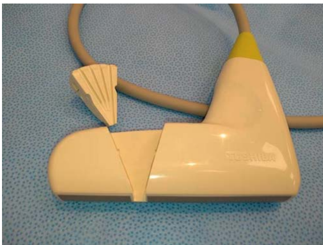
► Fig. 7 Ultrasound probe with puncture channel with removed needle guide. As a rule, these ultrasound probes and needle guides must be sterilized since the needle in the channel touches both parts.

In November 2014, the Regional Anesthesia Working Group of the German Society of Anesthesiology published its S1 guidelines, which require that the ultrasound probe and cable be covered with a suitable sterile cover in ultrasound-guided regional anesthesia. No differentiation is made between “single shot” and “catheter-based” regional anesthesia. Moreover, only sterile ultrasound gel or another sterile fluid can be used to improve image quality. In addition, all persons participating in catheter implantation must wear a surgical cap and a new surgical mask. In single-shot puncture, only a surgical mask is necessary. The sterile gown and surgical cap can be dispensed with [20].