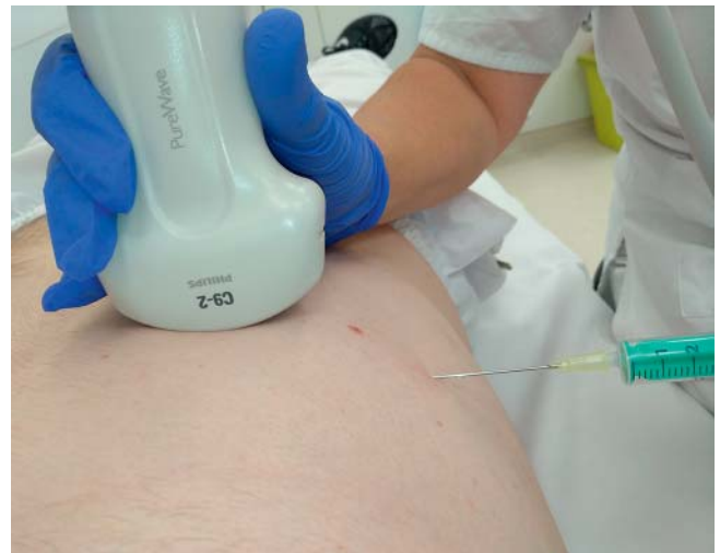
► Fig. 2 A safety distance between the ultrasound probe and the sterile needle is maintained in this freehand biopsy. If the examiner can ensure that the needle will not come into contact with the ultrasound probe, a sterile ultrasound probe cover is not necessary.

after every use is sufficient here. Disinfectants with only bactericidal and yeasticidal (yeast killing) activity are to be used.