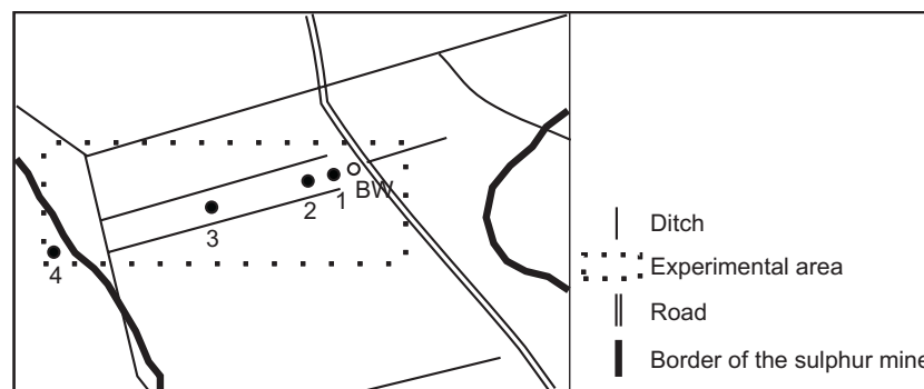
Fig. 2. Scheme of the underground melting sulphur mine (Nemyriv, Ukraine). Tested soil profiles at the distance of: 20 m (1); 40 m (2); 120 m (3) and 260 m (4) from the boring well (BW).

All laboratory tests were conducted on air-dried sieved (2 mm) soils according to standard methods, in three replications: soil organic carbon ( C_{org} ) by the method of Turin (with Simakov modification); pH in H_2O by the potentiometric method in soil/water suspension (1:2.5 w/w); S_{tot} and SO_4-S – by the nephelometric method of Barsley- Lankaster; dehydrogenase activity (DHA) – according to Galstyan (1978).