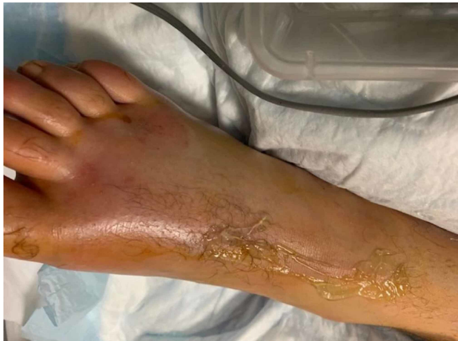
FIGURE 2: Swollen foot with a lack of pulse

Because of the patient's prior narcotic abuse, the patient needed higher doses of opiates postoperatively, and it was challenging to evaluate pain as a symptom to assess the recovery of his right lower limb. On postoperative day 3, his foot showed swelling with a lack of pulse (Figure 2).