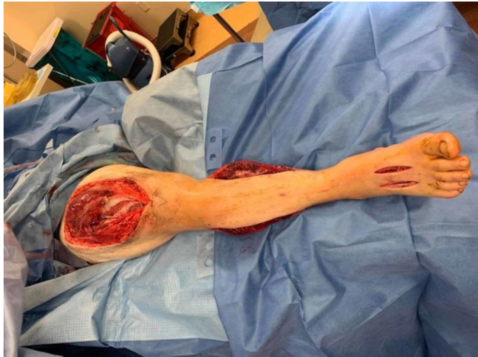
FIGURE 3: After foot fasciotomy, prior incision shows adequate thigh and leg fasciotomy

an immediate bulge of the muscle was suggestive of foot compartment syndrome, and there was the quick return of pulse postoperatively (Figure 3).