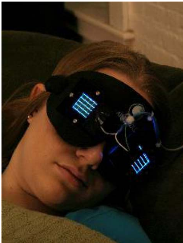
Figure 2 Flashing blue light mask used by older adults living at home. Notes: Flashing light was delivered through closed eyelids during sleep. The blue light mask shown here contains two blue LED arrays ( \lambda_{max} = 480 nm, FWHM = 24 nm), one for each eyelid. In the study, the light-stimulus condition was a train of blue or red light pulses: 2-second duration light pulses spaced apart 30 seconds, for no more than 3 hours, delivered before predicted minimum core body temperature. 95 Abbreviations: LED, light emitting diode; FWHM, full width at half maximum.

Following the laboratory study, Figueiro 87 collected field data from 28 participants (nine early awakening insomniacs) in an 8-week, within-subjects study. Twice, participants collected data during 2 baseline weeks and 1 intervention week. During the intervention week, participants wore a flashing blue (active) or a flashing red (control) light mask during sleep (Figure 2). Light was expected to delay circadian phase. Saliva samples for DLMO were collected at the end of each baseline and intervention week. Wrist actigraphy and Daysimeter 15,61 data were collected during the entire study. Results showed that, compared to baseline, flashing blue light, but not flashing red light, significantly delayed DLMO (by approximately 34 minutes). Compared to day 1, sleep start times were significantly delayed (by approximately 46 minutes) at day 7 after the flashing blue light. More importantly, the light intervention did not affect sleep efficiency. Future work should investigate how effective a light mask can be at delivering phase advancing light to adolescents and DSPD patients while they are asleep. The challenge would be to determine the timing of CBT nadir, so that light can be applied at the correct portion of the PRC. A recommended