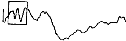
FIGURE 1 Normal somatosensory evoked potential produced by stimulation of posterior tibial nerve during anaesthesia. Post-stimulus peak latencies and peak-to-peak amplitudes of the enclosed W-shaped complex are monitored during operation. Later components of the waveform are so variable that we do not find them useful for monitoring.

Evoked potentials were monitored using a system developed by one of the authors (RHB) for recording SCEP in the operating room. 15 Each full set of SCEP records included sixteen waveforms: three averaged responses to stimulation of each extremity and background averages without somatosensory stimulation from each set of recording electrodes. Stimulation and recording parameters are listed in Table II. A representative waveform is shown in Figure 1.