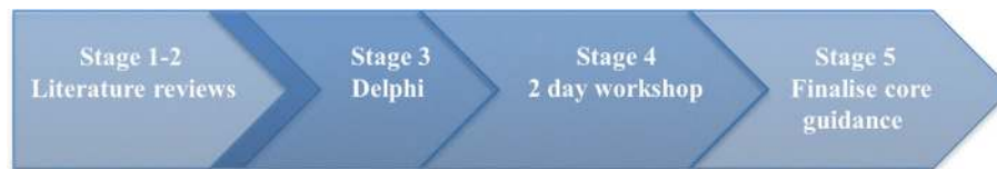
Fig. 1 DELTA2 project components of work