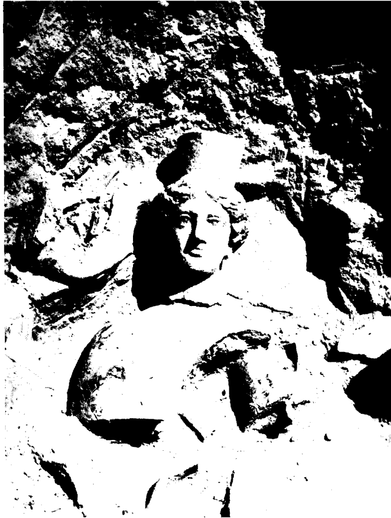
TERRACOTTA BUST OF DEMETER, AS FOUND ON FLOOR OF ROOM 5