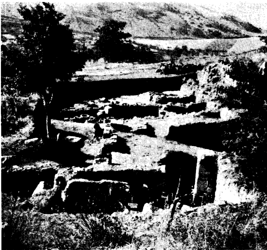
SOUTHERN DEMETER SANCTUARY AT MORGANTINA. HOUSE OF THE PRIEST, LOOKING SOUTHEAST