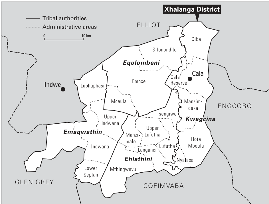
Map 2 Map of the Xhalanga District showing the four tribal authorities