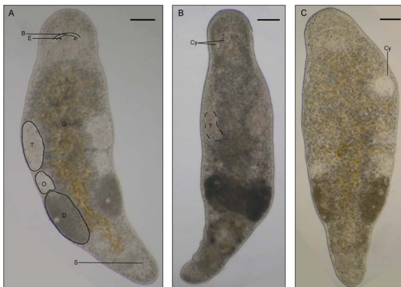
Figure 2 Morphology as a function of age. Individuals at four weeks (A), 27 weeks (B) and 76 weeks (C) of age. The brain, left testis, left ovarium and a developing egg are outlined in (A). Furthermore, the organs that can be easily observed are named. B: brain, E: eye, G: gut, which is filled with yellowish diatoms, T: testis, O: ovarium, D: developing egg, S: copulatory stylet. With advancing age, internal organs become less distinguishable as shown for the left testis as an example (A: full line; B: dotted line; C: no line). Furthermore, the body becomes more opaque as a function of age. The opaqueness is, however, variable between individuals and in this figure, it can be best observed in (B). Another characteristic change is the appearance of bulges and grooves in the epidermis. As a result, the right eye is out of focus in (C). The occurrence of body deformities such as cysts (Cy) is also frequently observed. Scalebars: 100 μm.

acceleration should be studied in addition. In a wide range of animal populations, including human, an exponential increase in the age-specific mortality rate is observed after maturation and is considered a hallmark of senescence. However, the increase in mortality rate decelerates at advanced ages in several species [5,15]. A similar mortality pattern can be observed in M. lignano (figure 3). There are several possible explanations for this, the first one being the genetic heterogeneity of the population. As the population ages, frailer individuals with higher death rates will die out in greater numbers than those with lower death rates, thereby transforming the population into one consisting mostly of individuals with low death rates [5,15,16]. A second explanation is that the chance of