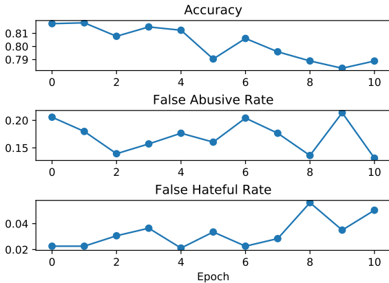
Figure 1: Accuracy of the entire development set of FDCL18 (top), and FPR rate for abusive (middle) and hate (bottom) speech detection for tweets inferred as AAE in the development set. X axis denotes the number of epochs. 0th epoch is the best checkpoint for pre-training step, which is also the baseline model.

labeled as AAE by the dialect classifier were also annotated as toxic (97%). Thus, the subset of the data over which our model might improve FPR consists of merely < 3\% of the AAE portion of the test set (49 tweets). In comparison, 70.98% of the tweets in the FDCL18 test set that were labeled as AAE were also annotated as toxic. Thus, we hypothesize that the performance of our model over the DWMW17 test set is not a representative estimate of how well our model reduces bias, because the improvable set in the DWMW17 is too small.