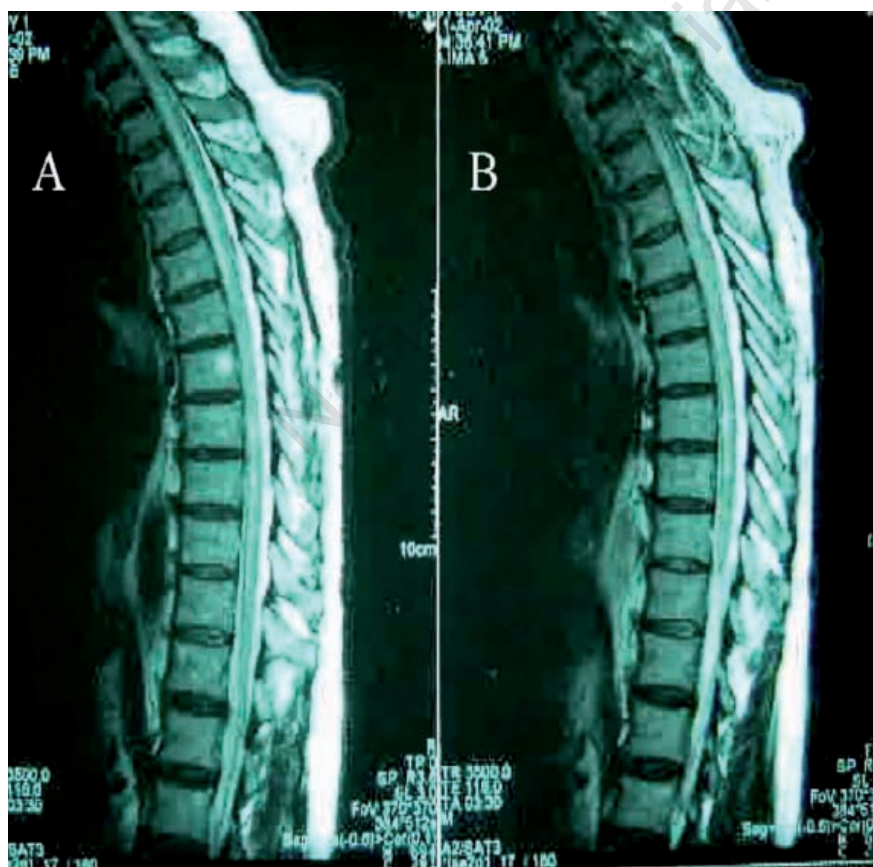
Figure 1. A and B Magnetic resonance image of dorsal spinal cord showing an enhanced signal in a patient presenting acute myelitis. Sagittal plane, T2 sequence.

Several viruses have been associated with inducing benign acute myositis. In a study in India, 50% of benign acute childhood myositis cases were attributed to dengue infection. 23 Myositis has a wide clinical spectrum, ranging from mild proximal asymmetrical weakness of the lower limbs to severe, rapidly progressing,