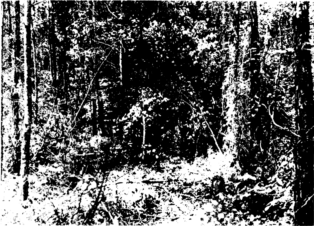
Figure 2.—Dense undergrowth obscured the row being removed. A felled tree lies adjacent to the leave row on the right,