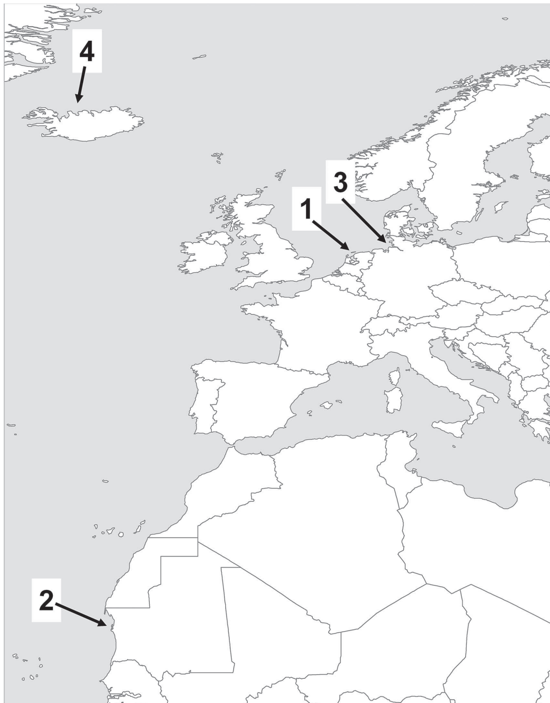
Figure 1. The position of the various ringing and ring-reading locations. 1, Dutch Wadden Sea; 2, Banc d'Arguin, Mauritania; 3, German Wadden Sea, and 4, Iceland. See also Table 3.

colours) and a flag (colour-ring with an extension) on eight different positions (Brochard et al. 2002, Piersma & Spaans 2004, see also www.nioz.nl : and then navigate the site via research, scientific departments, marine ecology and projects to Colour Rings). In this