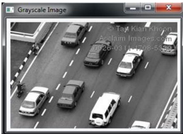
Fig 3 Gray Scale Image

The grayscale image can be used to display the objects in the format of black and white. In this system the output will be display the grayscale image after getting the source image only, because source image only converted into the grayscale image.