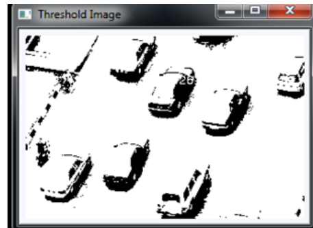
Fig 4 Threshold Image

The threshold image brightness or contrast of the grayscale image. In this system we can convert the grayscale image to threshold image.