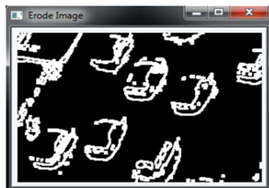
Fig. 6 Erode Image

The Erode image also like the canny image it can be used find the edges with the darked lines. In our system the edges of the vehicles are detect with the darked lines Before converting the canny image to Erode image, the canny image will be destroyed.