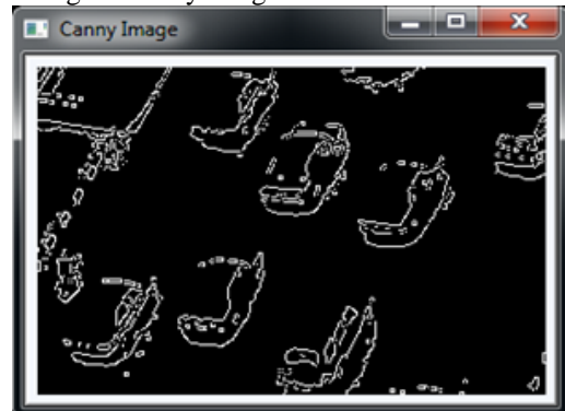
Fig. 5 Canny Image

Canny image is the image one of the edge detector that can be used to outline the edges of the objects. It can be help full for find out the objects. Here we have convert the threshold image to canny image