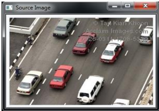
Fig. 2 Source image

In this system the source image is the RGB image which can be given by the users for getting the contour image and the vehicle count in output screen. The following code can be used to auto size of the output screen .Fig 2