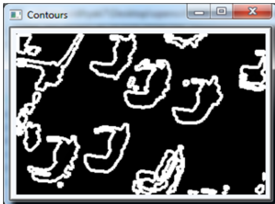
Fig. 7 Contour Image G. Output screen

The two types of output screens are displayed in this system. They are,