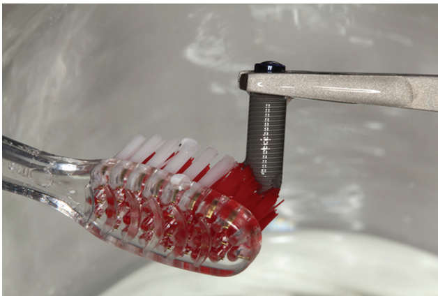
Fig. 1 Dental implant brushed with a soft bristle toothbrush and sterile saline.

The aPDT group presented the lowest number of CFUs ( 19.38 \times 10^5 \pm 1.493 ) when compared with the SB group ( 26.88 \times 10^5 \pm 2.496 ), S group ( 47.75 \times 10^5 \pm 4.735 ), and the PC group ( 59.88 \times 10^5 \pm 1.436 ), with statistically significant differences ( p < 0.01 ). The SB group had a significantly lower number of CFUs when compared with groups S and PC ( p < 0.01 ) and all the