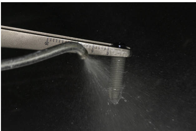
Fig. 2 Dental implant receiving air-powder abrasive system with sodium bicarbonate for 1 minute.