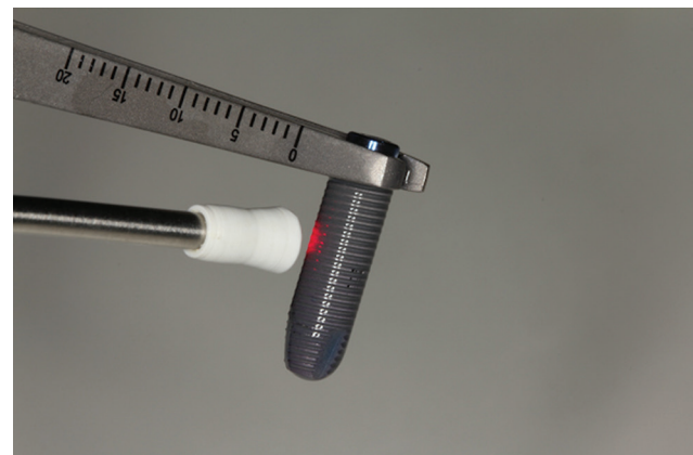
Fig. 4 Implant being irradiated with red laser (Whitening Lase II-DMC, São Carlos, Brazil) for 47 seconds.