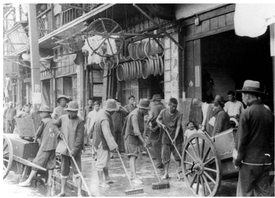
Fig. 2 Cleaning the pavement in Shanghai in ca. 1920

Sweeping the streets was certainly a basic method of removing stench. As early as 1856, in one meeting of the Council, G. Gray, a member of the Council, reported that Mr. Dallas had been entrusted to remit 50 pounds to London in order to buy 'two water baths for watering the roads.' This determination reflects the mentality of the earliest British colonisers: an insistence on purification by means of their own 'technique.' The by-laws of the 1869 Land Regulations contain two articles about cleansing streets, one concerning the public streets (article XVIII) and the other the areas in the front, side or rear of private premises (XXV). To clean the public streets in 1861, for instance, fifty cleaners were at work each day. In the 1870s the Council had at its disposal nearly 100 cleaners, six carriages and several wheelbarrows. Main streets of the Settlement were cleansed twice a day (Fig. 2).