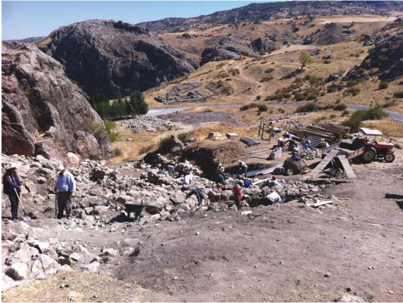
Figure 6. Archaeological excavation and restoration at the site.

because they are excluded from important stages. All in all, these three different heritage sites and associated communities, differing in scales, emphasize that local communities need to have the right to manage their local heritage and have economic rights to those sites, rights which I argue should be considered as human rights. More importance should be paid to this significant aspect as I will discuss below.