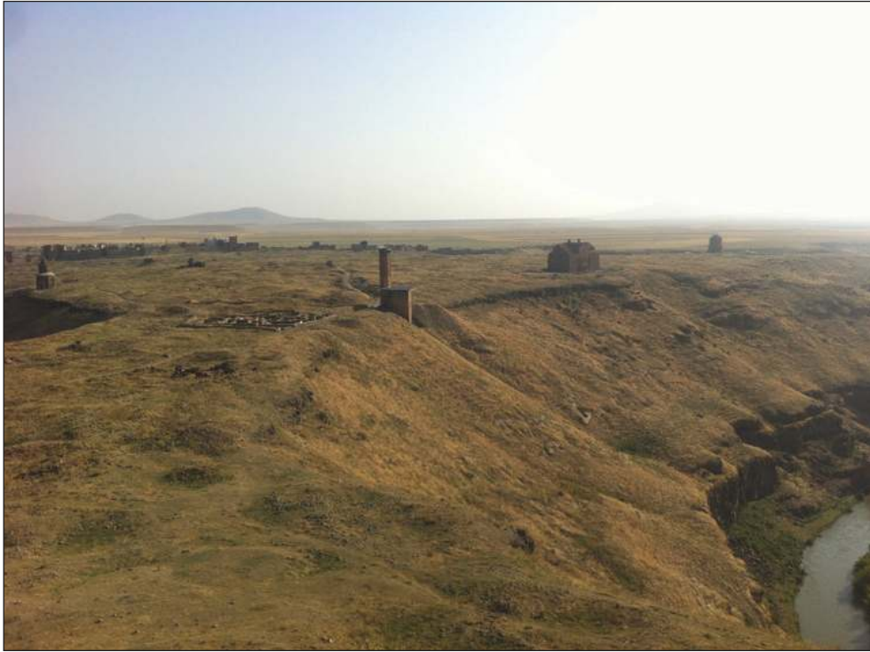
Figure 2. Overview of Ani.

management of Ani. However, there has been no initiative taken to solve the local community's problems (poverty, lack of infrastructure, etc) and their demands to benefit directly from the heritage site. Additionally, locals have not been even informed on how to participate on the management of the site. This, without doubt, is indicative of the 'top down approach', which excludes ordinary people from any decision-making processes. Therefore, while the local community has vitally important issues, such as lack of suitable drinking water and housing, and people are struggling to survive, is it ethical to deprive them of the direct economic benefit of Ani tourism and managing local heritage without the locals' participation?