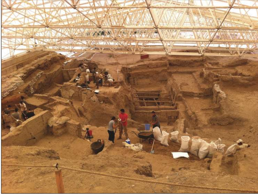
Figure 3. Çatalhöyük Neolithic houses. South area.

shaping their economic structure: the locals pointed out in interviews that their priority is ‘improvement in agriculture, health, infrastructure, education’. However, they also have a high economic expectation from the heritage sites which are located in their landscape. These sites have been protected until the present because of the local communities’ existence around the heritage site: locals are the natural guards for heritage sites (Pearson and Sullivan 1995).