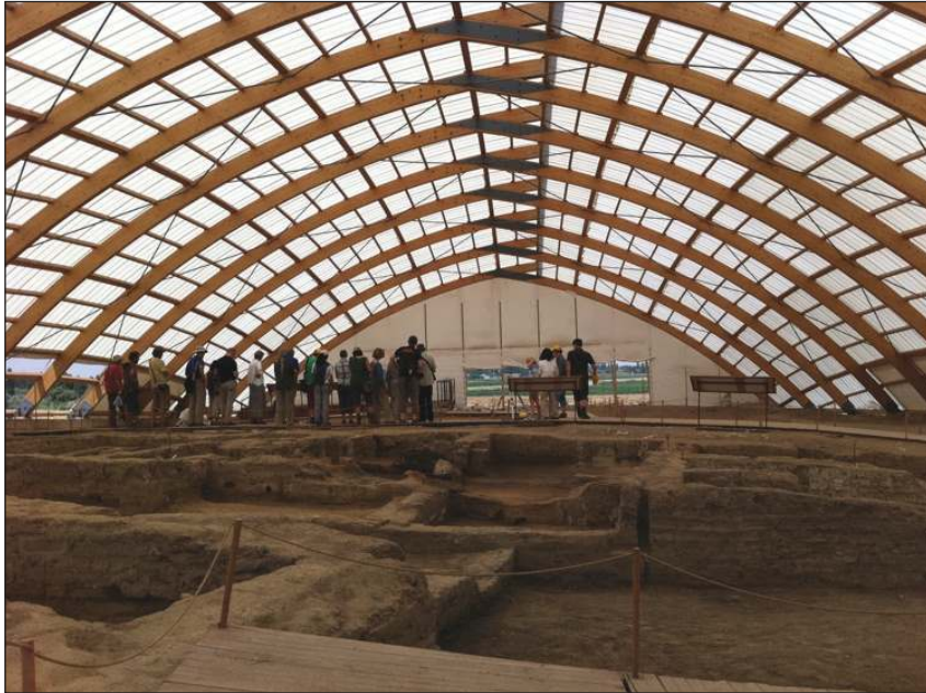
Figure 4. Çatalhöyük Neolithic houses. North area.

of top down approaches in countries where the centralized decision-making process is quite dominant. In the section, ‘decision makers’, included in the Site Management Plan are: ‘Governance (Ministry of the Interior), Culture and Tourism (Ministry of culture and Tourism), Tourism Agencies.’ However, the local voices were completely neglected. The Çatalhöyük Research Project runs a festival every field season in which all locals are invited to join a site tour, visit the house excavation and attend a lecture. During these lectures, locals are informed in detail about the development of the site and excavations (see Çatalhöyük Archive Reports). This is, surely, well-intended, however, it is not enough for locals to be able to take part in the management of the development of local heritage.