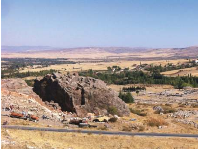
Figure 5. Over view of Hattuşa and modern town.

come during the high tourist season, which is a positive impact and which can be seen in many heritage sites (Chhabra 2009: 4). However, like the other case studies, large sums of the site income, such as site entrance fees, go to the central government, or to tourism agencies. Most of the locals in the town point out this unequal proportioning of the site income, as it is noted for other parts of the world (Silberman 2013).