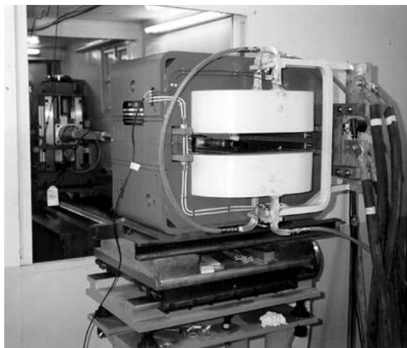
Figure 2. Prototype arc dipole at IHEP.

will have to include extra windings to provide a skew quadrupole field. A design for such a combined-function magnet is being studied, with encouraging results.