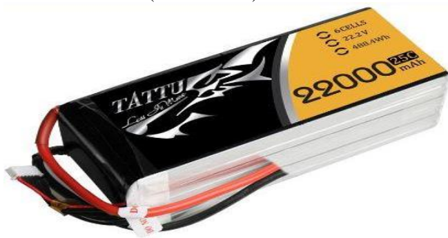
Fig -5: Li-Po battery

The battery that can be used is a Li-Po battery of 22000mAh capacity and 22.2 V. In this battery six Li-Po cells are connected in series ( 6 \times 3.7 = 22.2V ).