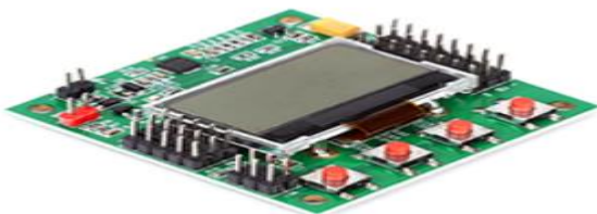
Fig -6: KK 2.1.5 Multi-Rotor LCD Flight controller

The flight controller helps in the maneuvering operations and also it provides Auto level function. The accelerometer and gyroscope sensors in the Flight controller processes the signals from the receiver and gives the output to the ESC. The KK 2.1.5 Flight controller board can be used in the drone as it has inbuilt firmware. The features of this Flight controller board are much easier for calibration. It uses ATMEL Mega 644PA 8-bit AVR RISC-based microcontroller with 64K of memory.