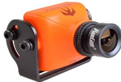
Fig -8: FPV camera

The camera that can be used is HD FPV camera 1200 TVL, it has 2.8mm Lens, auto/color/ black & white Day and night format. TS5828 32CH mini transmitter can be connected to the camera for transmission of video signals to receiver at ground.