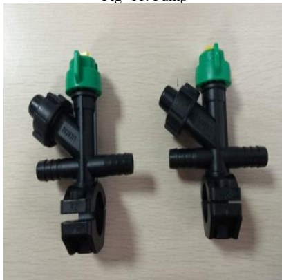
Fig -12: Flat fan Nozzle