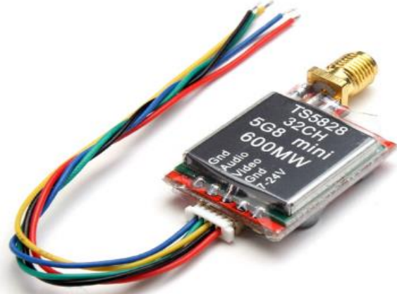
Fig -9: Video Transmitter

5.8G UVC receiver is used to receive the video signals. It can be connected to the android mobile which has installed the GO FPV application in it.