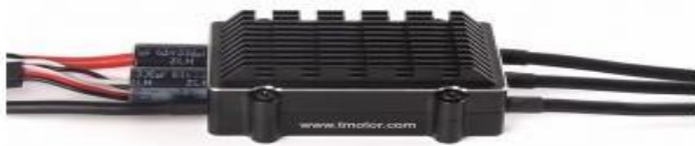
Fig -4: Flame 60A HV