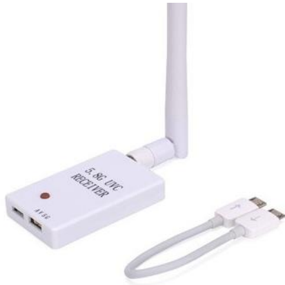
Fig -10: 5.8 UVC OTG Receiver