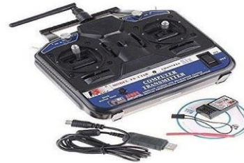
Fig -7: Fly sky CT6B 2.4 6CH Transmitter and FS-R6B Receiver