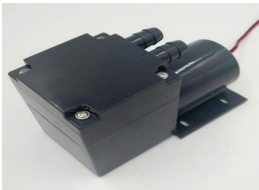
Fig -11: Pump

To pressurize the liquid a 12 V DC water pump can be used which has 2.5 L/min capacity can be used. Then the pressurized liquid enters the nozzle and gets sprayed. The nozzle that can be used is a flat fan type for spraying the liquid. Four nozzles are connected with ducts and they are placed at 45cm distance between each other.