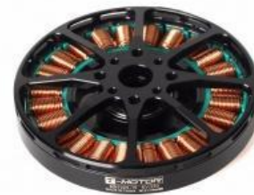
Fig -2: T-MOTOR MN 7005 KV115

Outer runner BLDC motors in which there are no brushes, they have a permanent magnet. The RPM of the motor can be controlled by varying the input current. This motor T-MOTOR MN 7005 KV115 and P24x7.2F propeller produces a maximum thrust of 4783 grams.