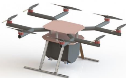
Fig -14: CAD Model of Drone

The selection of material is as crucial as selection of configuration of arms. The material plays a significant role in determining the drone’s stability and efficient performance. The material for the arms was chosen as carbon fibre due to its properties like light weight and higher strength- to-weight ratio. However, the radio and antenna were connected properly to stop the radio signal interference by carbon fibers. The material for base plate was selected as Carbon/Kevlar composite due to its properties like high tensile strength, no shrinkage and embrittlement at extreme temperature, scratch and electrically resistant. The landing frame is made up of aluminium alloy owing to its light weight and yield strength. The cad model of our design as shown in figure 13 is made in SOLIDWORKS 20.