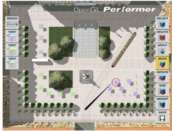
Figure 5: The top view of the VE is displayed with two sets of menus for the insertion and manipulation of dynamic objects. An element (shown with the small circle) is attached to the end of the rod and can be moved and positioned freely.

The user can manipulate dynamic elements in the scene, such as benches, umbrellas etc. in the top view, inspired by the iterative sketches process (Fig. 2). The user has the ability to freely switch between top, perspective and balcony view at any time and perform manipulations in all three.