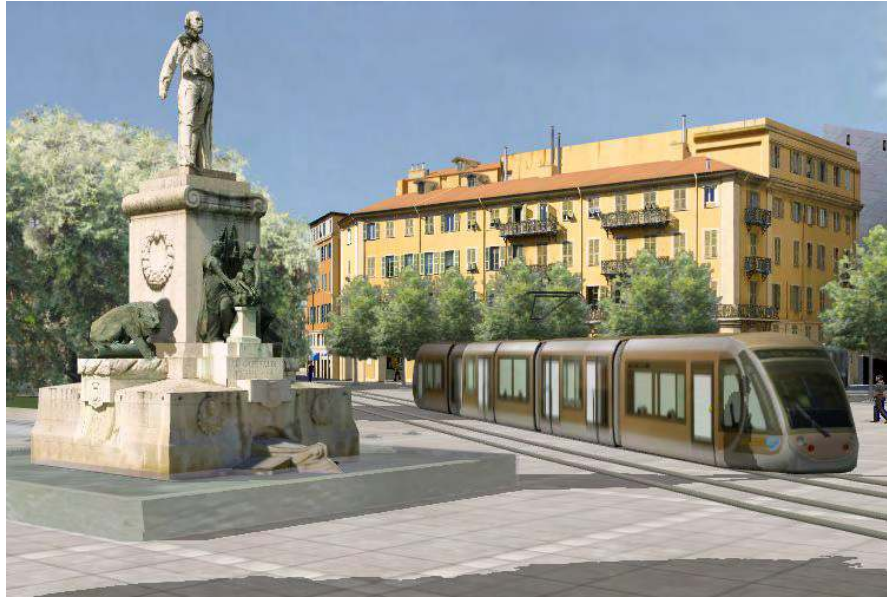
Figure 1: The Virtual Environment of Place Garibaldi in Nice, France, constructed for the study of a future Tramway project.

In the first case, the challenge has been to visualize large data sets in as photorealistic a fashion as possible. These environments are mostly used for presentation, recreation, and educational purposes (e.g. review of architecture before it is actually built, cultural heritage reconstructions, 3D entertainment rides, etc.) where complex 3D spaces are constructed so they can be explored in walkthroughs (Brooks, 1986; Houston, Niederauer, Agrawala, & Humphreys, 2004). The majority of these projects allow for little to no interactivity beyond the user's ability to freely navigate about the environment.