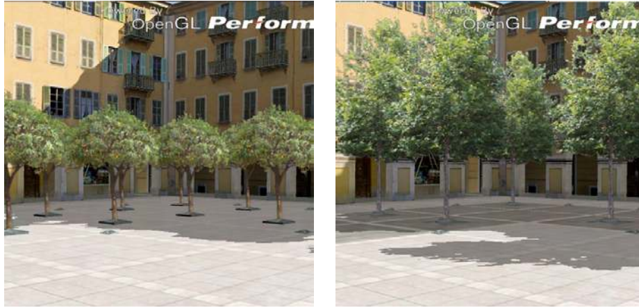
Figure 8: Snapshots of the different solutions for Place Garibaldi, used in the City Hall meeting and the brainstorming session with the architects. Left, the “orange tree” solution; right, the “oak tree” solution. Note how shadow coverage is very different in each.

The working group involved a total of ten persons, mainly high-ranking city officials in charge of public spaces and urban planning, and the architects in charge of the overall project.