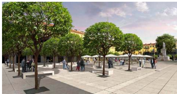
Figure 4: Detailed photo-montages are used to present the project to decision makers.

The next stage is the production of photo-montages which are shown to the decision makers and elected officials (Fig. 4). These montages are used to achieve agreement by the different parties and, after this process, the overall “look and feel” of the design converges (i.e., the overall “stone look” of the square, the fact that the trees and the statues are maintained, etc.).