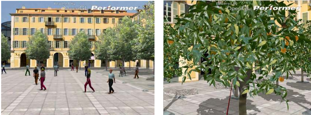
Figure 10: Left: an example with crowds in the Square. Right: Mixed point-based/polygon trees.