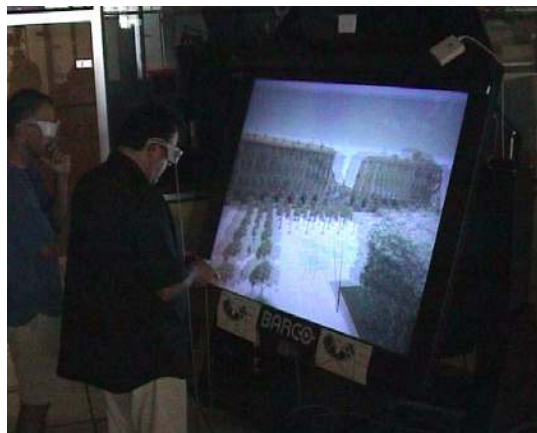
Figure 7: View of a user of the system on the workbench during the experiment (the screen shows the actual stereo display).

The experiment took place on a Barco Baron workbench 3 with the tracked game controller operating as described previously (Fig. 7). The participant was head-tracked and wore active stereo glasses.