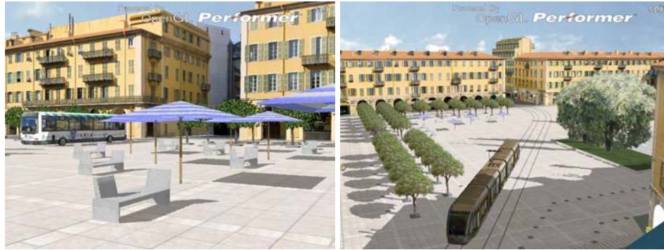
Figure 6: (Left) Simulator snapshot of the perspective view. Note the realism of the captured facades of the buildings, shadows and point-based rendering of trees. (Right) Balcony view of the Place Garibaldi, showing the Tramway passing through the square.

The user can manipulate dynamic elements in the scene, such as benches, umbrellas etc. in the top view, inspired by the iterative sketches process (Fig. 2). The user has the ability to freely switch between top, perspective and balcony view at any time and perform manipulations in all three.