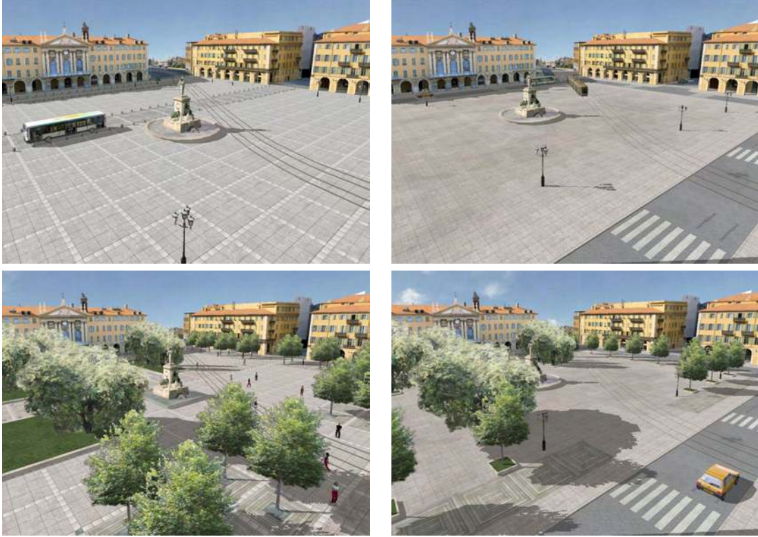
Figure 9: Screenshots of the 4 scenarios used during the presentation to officials.

various options for the square, concerning the questions of vegetation and the presence or absence of cars.