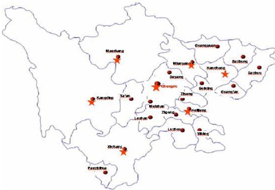
Figure 1. STC’s service areas in Sichuan Province, China