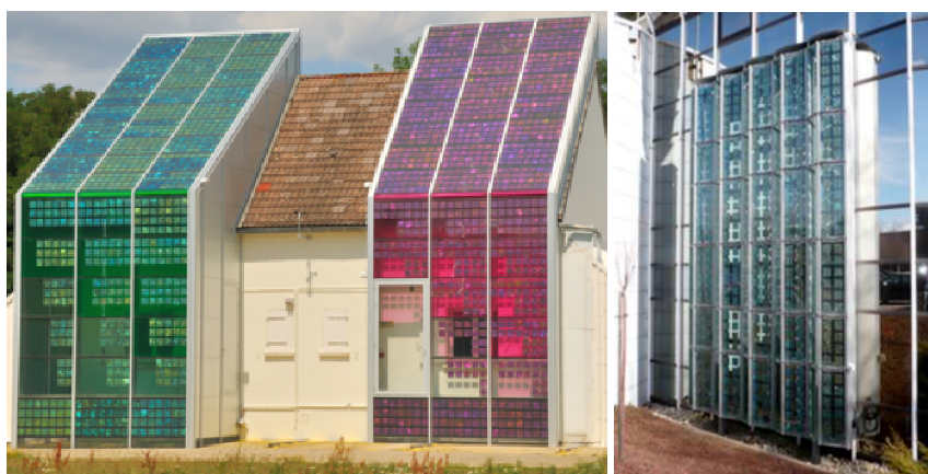
Figure 3. Double-skin prototype for detached houses (ETNA Test house – EDF R&D). Pleated façade prototype for office buildings (HBS-Technal)