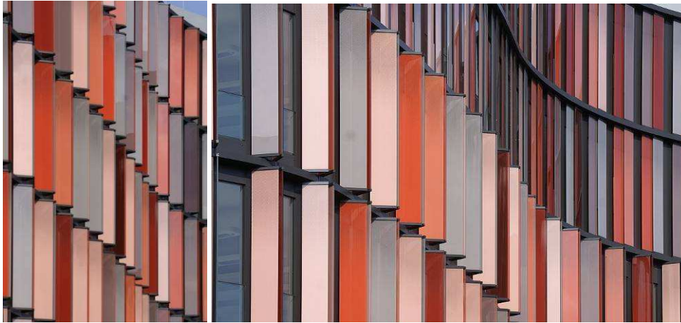
Figure 2. The Oval Offices in Cologne (arch. Sauerbruch and Hutton, 2010) The vertical axis glazed sun louvers serve the purpose of light regulation and, simultaneously, perform as outstanding architectural façade element.

Although switchable glazing solutions are definitely gaining popularity, the most common way of exterior solar shading is via mechanical louvers, shutters, screens or blinds. An iconic example where the mechanical façade system also serves a distinctive architectural function with high visibility are the Oval Offices in Cologne, designed by Sauerbruch and Hutton Architects, 2010 (Figure 2)