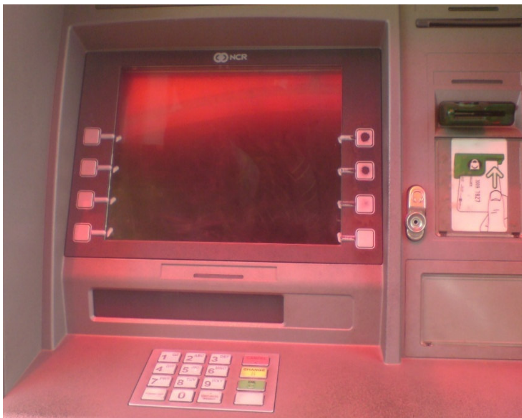
Figure 1. A typical ATM.