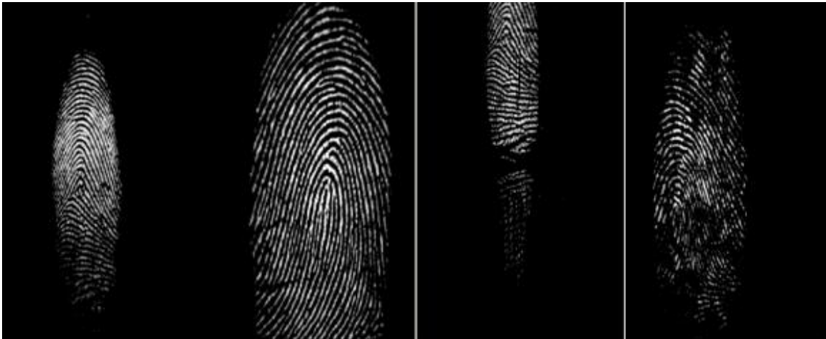
Figure 1.1 Fingerprint Images before Iterative Fast Fourier enhancement

We have used four datasets DB1, DB2, DB3 and DB4 from the fingerprint database i.e. Fingerprint Verification Competition 2004 (FVC 2004). Each of these four disjoint datasets is collected by using different sensors. This database consists of 1800 fingerprint images those have been used in this research. In FVC2004, data collection is done with introducing difficulties as wet/dry impressions, rotated fingerprint, light/dark fingerprint impression etc. The performance of the proposed fingerprint enhancement algorithm has been evaluated on FVC2004 DB1, DB2, DB3, DB4 public domain fingerprint databases. Results of proposed enhancement algorithm are shown in figures 1.1 and 1.2.