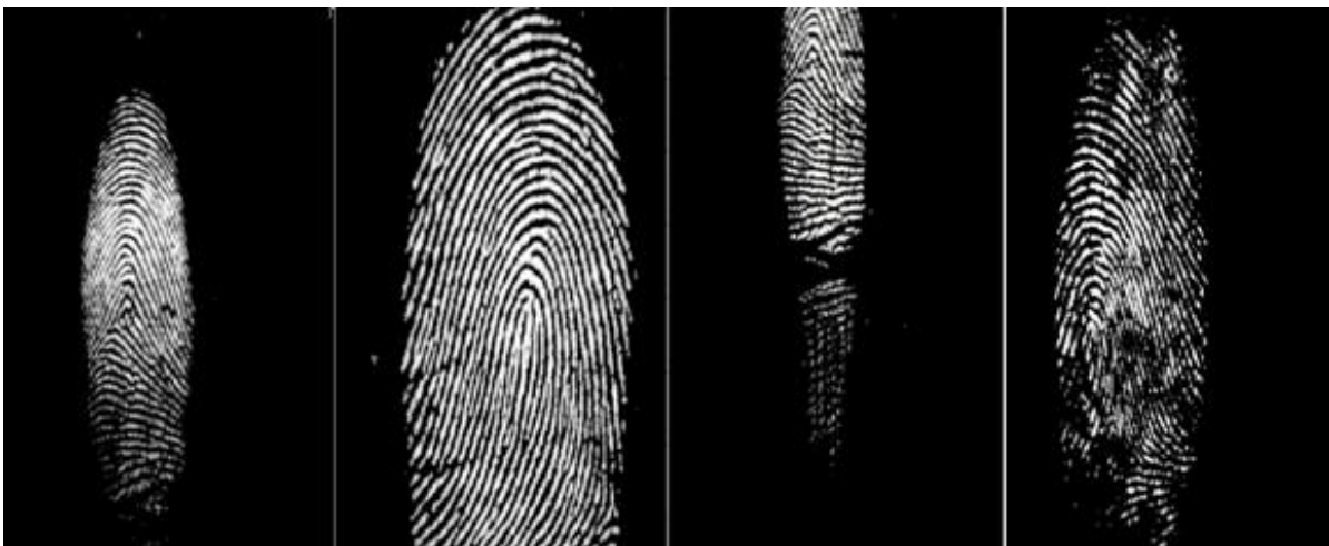
Figure 1.2 Fingerprint Images after Iterative Fast Fourier enhancement