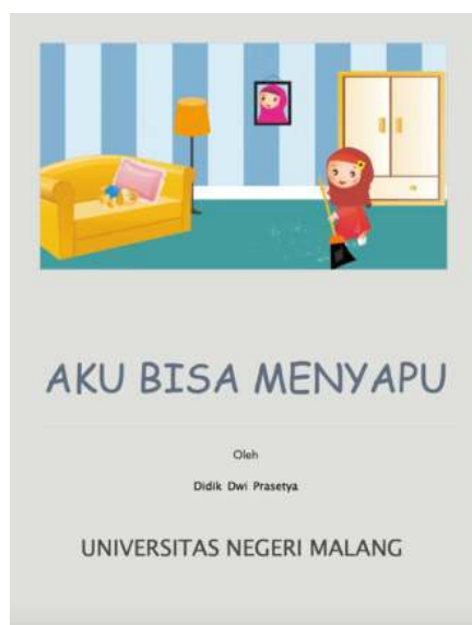
Fig. 1. Cover design result of a digital storybook

The development of digital book application emphasized the interface design with clear visual images to achieve children’s understanding. The page view came with a design which has been familiarized with children’s daily lives, which is expected to be able to draw children’s interest. The cover page shows the main image which represents the topic of the story. For instance, the topic of the storybook in Figure 1 is sweeping the floor, and it is entitled as “ Aku Bisa Menyapu ” (I Can Sweep the Floor).