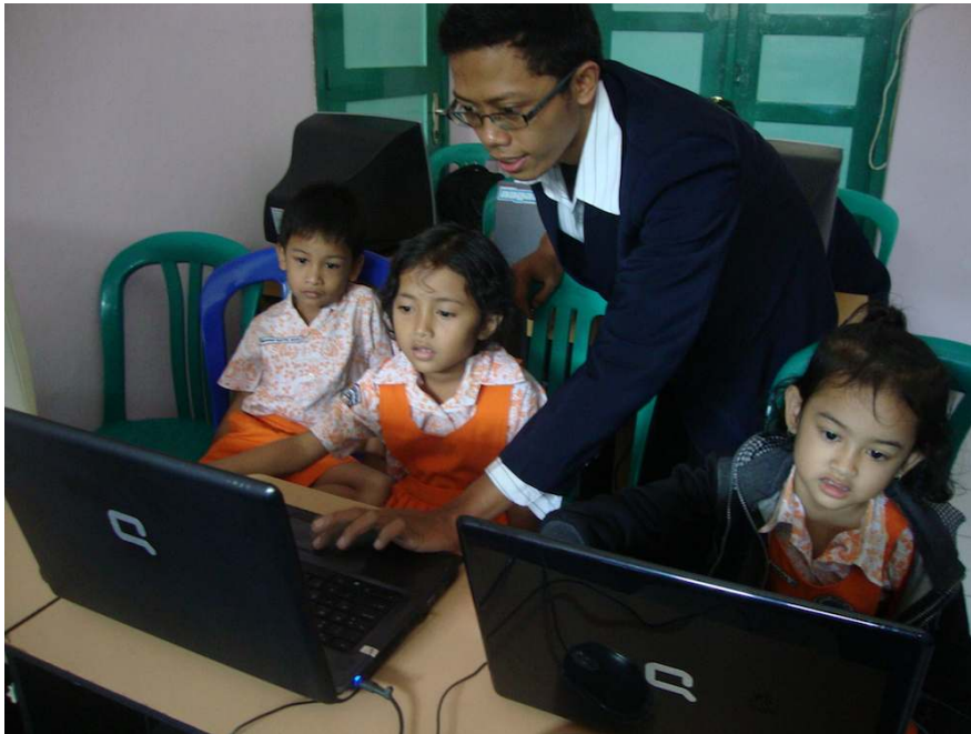
Fig. 6. Field test in preschool children