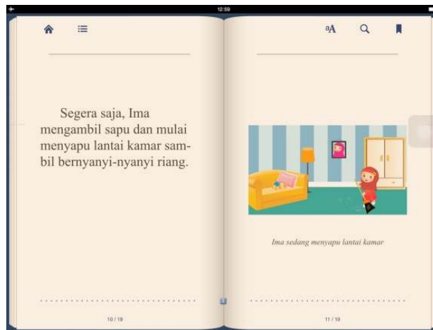
Fig. 2. Text and image content of digital book

Referring to the EPUB 3.0 specification, this digital book design also utilizes one excellent feature, that is very interesting, which is read aloud. This feature represents text-to-speech that can read EPUB text content. Basically, read aloud is playing the recorded audio first in accordance with the text that appears [29]. View of a digital book with read-aloud feature support is shown in Figure 4.