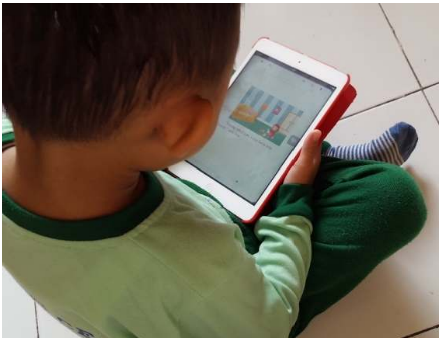
Fig. 7. Product test by using a mobile device