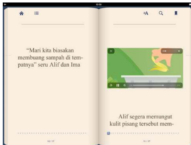
Fig. 3. Video content how to dispose of the garbage correctly