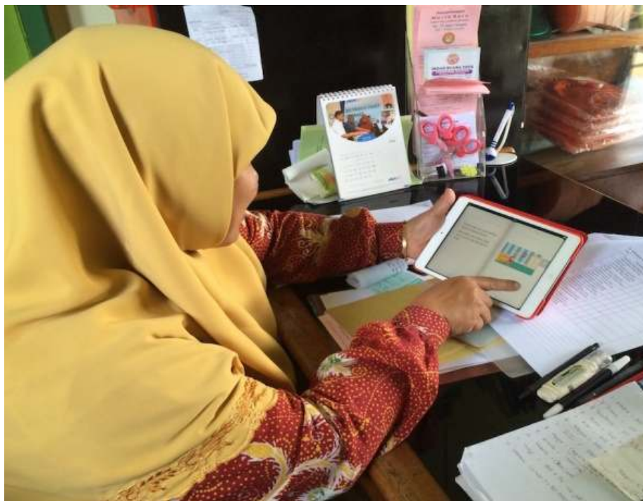
Fig. 5. Content validation by the kindergarten teacher

Once the product design is complete, the next step is to perform limited testing. The first field test was done to 10 students of “Lab” kindergarten (around 4-5 years old) who were randomly selected by their teacher. The test was performed by providing a laptop or desktop computer with the digital storybook application to children as shown in Figure 6. Teachers and the research team guided the students in operating the application. It can be seen that the children were enjoying the presented digital storybook.