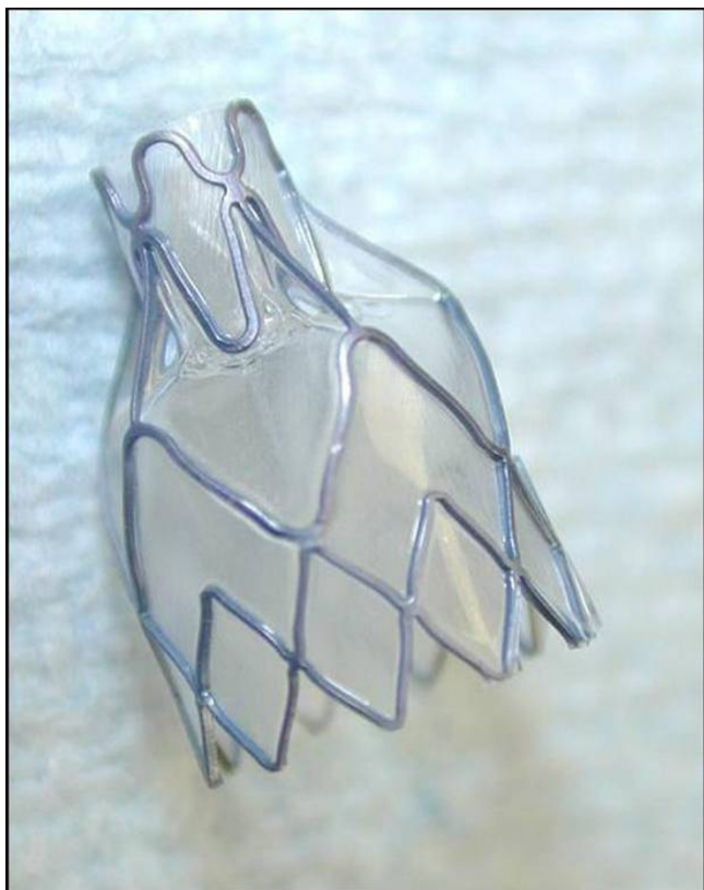
Figure 1 Zephyr® Endobronchial Valve side view.