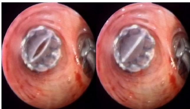
Figure 2 Implanted Zephyr® Endobronchial Valve end view. The Zephyr® Endobronchial Valve vents during expiration (left) and seals during inspiration (right) immediately after placement.

sema[9]. Additionally, the study is intended to identify patient characteristics or other procedural covariates that may affect the outcome of EBV placement and to shed further light on EBV mechanisms of improvement.