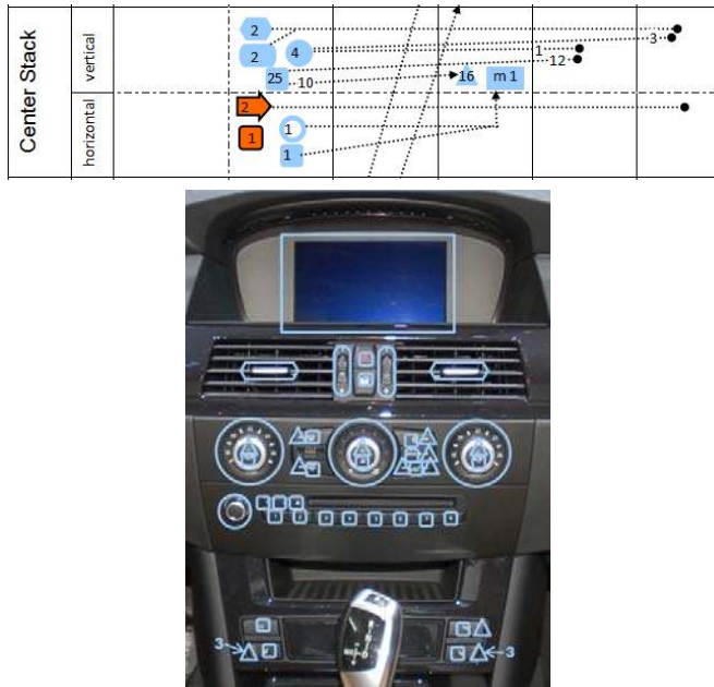
Figure 6. Detailed view of the center stack area. Corresponding markers (vertical) are shown in the photograph.

Figure 6 illustrates the connection between the symbols used in the graphical representation to real devices for the BMW 520d. In the photograph, the devices are marked by the same symbols. In this BMW series 5, 25 buttons are available, from which 10 provide visual feedback with an indicator light, and 12 are associated with the radio and provide audio feedback. The remaining 3 buttons influence the air conditioning system but provide no direct feedback. The two sliders and thumbwheels provide haptic feedback through their current positions. One continuous knob is used to control the volume, and the other three discrete knobs control the air conditioning system and provide visual feedback by indicating at which temperature they are set. The LCD screen shows visual feedback and is controlled by the iDrive controller, which is mounted in the center stack. Each of these input devices can be specified further using Card et al.'s design space for input devices [9].