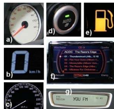
Figure 3. Output modalities: a) analog speedometer b) digital speedometer c) virtual analog speedometer d) indicator lamp e) shaped indicator lamp f) multifunctional display g) digital display

Visual representations are also used to give information that is directly correlated to the driving task, e.g. actual speed. Both analog and digital representation are used for these purposes (see Figure 3, a-b). Analog representations can also be divided into displays that use a physical dial and pointer and displays that replicate the dial and pointer virtually (see Figure 3-c). Virtual representations allow for more dynamic use of the space in the middle of the dial to show other information. Digital displays have been used since the end of the 1970s to show alphanumeric information, e.g. the current radio channel or traffic information (see Figure 3-g).