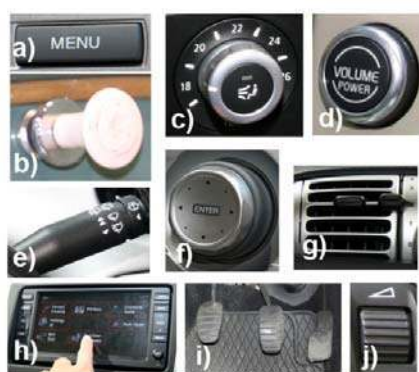
Figure 2. Input modalities: a) button b) button with haptic feedback c) discrete knob d) continuous knob e) stalk control f) multifunctional knobs g) slider h) touchscreen i) pedals j) thumbwheel.

We found eight different input possibilities. The most commonly used group are buttons, which are present in different sizes and shapes. Nearly all buttons in modern cars are soft buttons (see Figure 2-a). That means there is no permanent haptic feedback available; instead, a visual feedback is often used. For example, when the high beams are turned on, this is indicated lighting up a button. In the past, mechanical buttons were used, e.g. to turn on the lights. These buttons provided haptic feedback, e.g. when a button was pressed, it felt pushed in (see Figure 2-b). Thus, the driver could determine the state of the button without looking at it. Sliders form the next group. They are often used for adjusting the direction of the fan (see Figure 2-g). We distinguish two different kind of knobs, those that are continuous (see Figure 2-d), e.g. to control radio volume, and those that are discrete (see Figure 2-c), e.g. a knob used to adjust the temperature. Stalk controls are often attached to the steering wheel to indicate or to activate windscreen wipers (see Figure 2-e). On a multifunctional steering wheel, thumbwheels are often used to control volume (see Figure 2-j). Classical pedals are still available in the car: gas, brake and (in