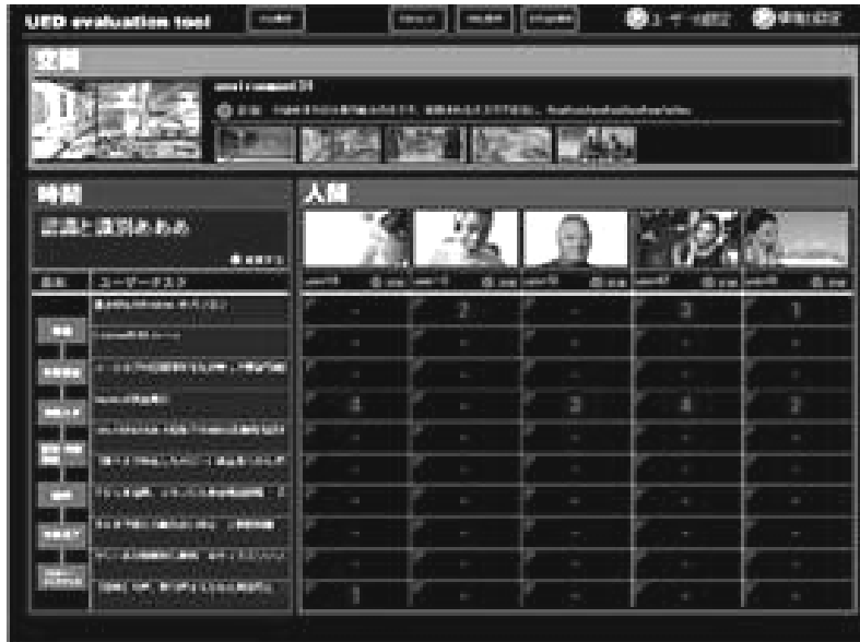
Figure 5: Evaluation Tool