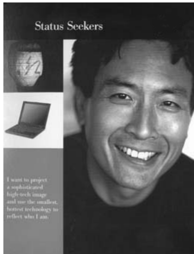
Figure 1: Example of Visual Scenario

For an innovative design, user scenarios need to be developed for each end user segment to share the goals and aspirations of these users with a variety of professionals. They use these user scenarios to create and evaluate new ideas. User scenarios are very important tools to