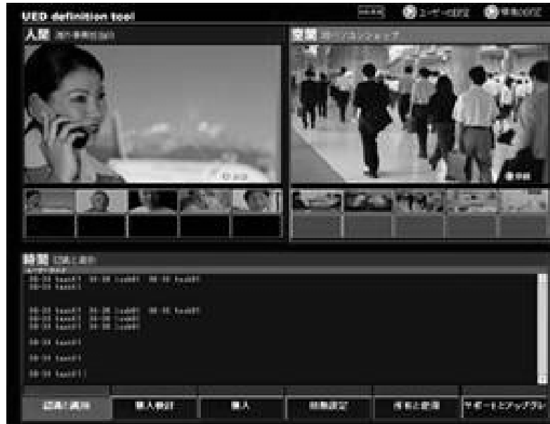
Figure 3: Definition Tool