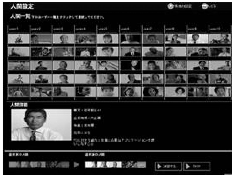
Figure 4: User View of Definition Tool