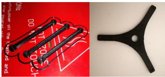
Fig. 3. Pushrods and rotary element

The Pushrods' print time was: 3 minutes per piece, and the rotary element took 10 minutes total.