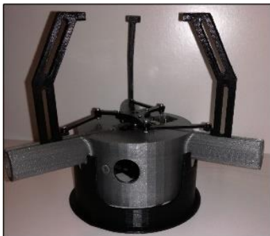
Fig. 4. The finished gripping tool on the holder

The total print time per finger was: 85 minutes, and required supporting material, the additional holder took another 163 minutes. The total print time did not go over 8 hours and their total weight is only 52,2 [g].