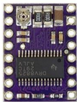
Fig. 2. Pololu DRV8825 module [10]

One of the greatest benefit of the IC is the so-called microstep function, which enables the user to split the steps of the motor to even more steps. In microstep, the user can distinguish 1/2, 1/4, 1/8, 1/16, 1/32 step angles, depending on the setting of the circuit. The correct microstep on the jumper on the driver can be set. Because DRV8825 is capable of 1/32 microstepping, this option was chosen. The maximum amperage and voltage is 2,2 [A], and 8-45 [V] over the motors in the case of Pololu.