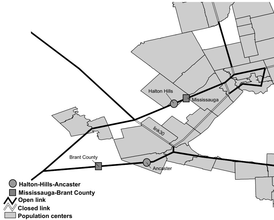
Figure 3 Roads Available for Trucks Carrying Gasoline, Fuel Oils or Alcohol

important in terms of applicability of the proposed solution. This is the underlying reason for us to categorize the four materials into two groups. A related question is “What is the implication of designing a single network common to all hazmat types?” It is possible to answer this question by solving a variant of HND , where Y_{ij}^m are replaced by Y_{ij} . Under this policy, Link 30 would be closed to H_{1600} shipments as well. This implies that 2,565 petroleum and coal tar trucks will have to take routes different than their minimum exposure path. Taking the argument to the other extreme, the question would be “What is the implication of providing the government agency with the authority and resources to designate shipment-specific routes?” In answering this question, one needs to minimize objective function of the outer problem subject to Constraints (2) and (4). The resulting model decomposes into a set of shortest path problems (one for each shipment), where population exposure parameters constitute the arc impedances. The impact of having no regulation , on the other hand, can be estimated by minimizing objective function of the inner problem subject to Constraints (2) and (4). The task, again, boils down to solving a set of shortest path problems. Table 2 summarizes the implications of these alternative regulatory schemes.