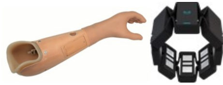
Figure 1. (Left) A myoelectric upper limb prosthesis – myo. (Right) The Thalmic Labs Myo Armband – Myoband.

Myoelectric signals are electrical impulses that occur naturally as we contract our muscles. Myoelectrically-controlled powered prosthetic devices (or myos) read muscle signals (using electromyographic sensors – EMG) from residual muscle tissue, and use them as control for motion [28,29]. The simplest myos open and close based on the presence of inner- and outer-forearm muscle activity (known as flexion and extension, respectively). However, many other control schemes exist and can work in combination, including proportional (adjusting the speed of motion proportionally with the intensity of muscle contractions), mode-switching (to enable selection between different types of movement), and pattern recognition techniques (for more natural control mappings) [17,33]. In this study, we focus specifically on proportionally-