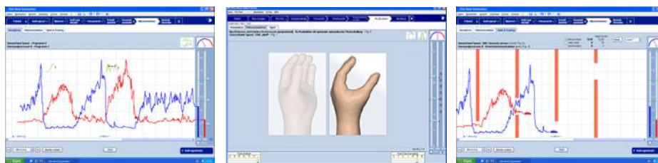
Figure 2: Ottobock PAULA training suite (raw muscle activity, prosthetic hand simulator, and car game, left to right)

Our initial game design was based on requirements