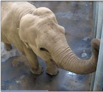
Figure 3: Valli listens to didgeridoo