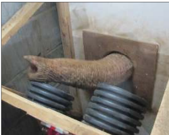
Figure 4: Reaching for pipe buttons through the wall