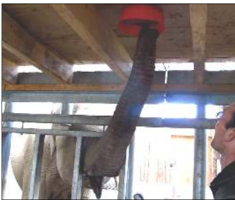
Figure 5: Valli activates the water supply