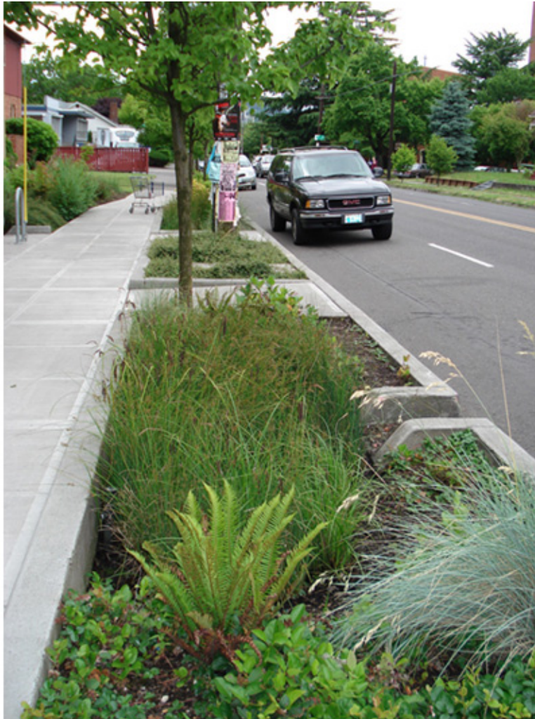
Figure 6. Raingardens developed between streets and sidewalks infiltrate stormwater from these impervious surfaces, while also supporting diversity in vegetation.

change (Seto and Fragkias 2005), population density (Kasanko et al. 2006), biodiversity restoration (Nordlind and Ostlund 2003), and many other variables. Comparative analysis can also be effective in assessing the impact of policy and planning decisions on the implementation of alternative spatial structures. Erickson (2004), for example, compared the historical context, institutional structures, and spatial patterns of two cities to develop a better understanding of the factors underlying the implementation of greenway systems. A number of organizing strategies have been used to improve comparative analysis