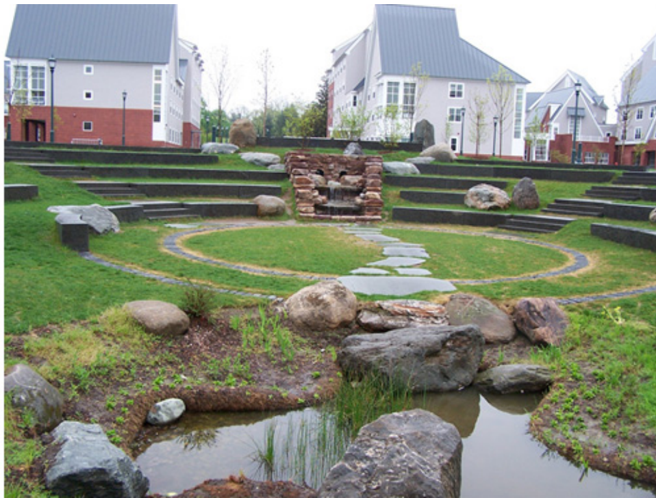
Figure 5. Multifunctional stormwater treatment feature in the residential dormitory green space at the University of Vermont.