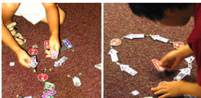
Figure 4. A student constructs a program with Quetzal during a week-long day camp on dinosaurs and robots.

School at Tufts University. The purpose of this investigation was to iron out any usability problems and get a basic sense for how students would react to physical programming. As part of the camp, the children used a Quetzal prototype to program robots that they had constructed. This investigation provided encouraging evidence that Quetzal can be viable and appropriate language for use with children in educational environments. For example, all of the children were easily able to construct and flow-of-control chains and read the sequence of actions out loud when asked. While not all of the children were able to understand the effects their programs would have on their robots, some were able to make predictions and correctly identify bugs in their code. After initial instruction, the children were able to build programs without direct adult help. There were also several examples of ad hoc collaboration between the children.