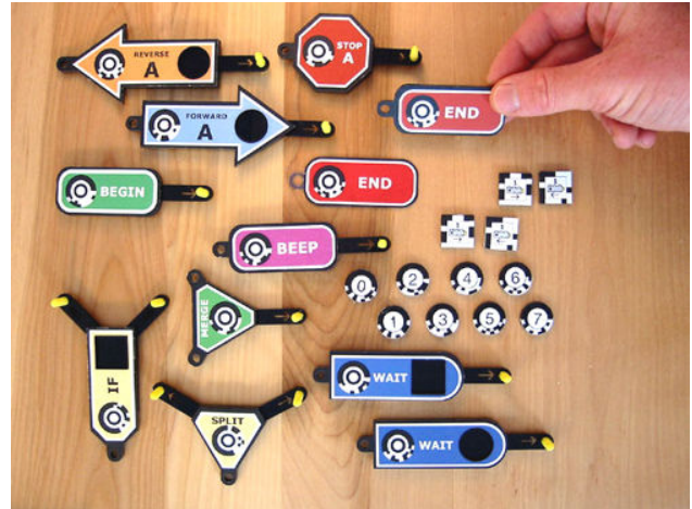
Figure 1. A collection of tangible programming parts from the Quetzal language

© ACM, 2007. This is the author's version of the work. It is posted here by permission of ACM for your personal use. Not for redistribution. The definitive version was published in the proceedings of the 1 st International Conference on Tangible and Embedded Interaction TEI'07, February 2007. http://doi.acm.org/10.1145/1226969.1227003