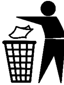
Figure 1. TidyMan symbol. (Permission by Keep Britain Tidy.)

The advent of the Internet and the development of the network society enable consumers to challenge traditional dynamics and provide feedback on a product or brand on a mass scale, extending value beyond the traditional linear chain. This is characteristic of a pull economy , which uses network technologies to respond to demand through customized services or fulfilling specialized needs, compared with the mass manufacture offered within push economies. The most well-known examples of pull economies are software platforms such as eBay, Google, and Amazon, who, without members, would be unable to offer services or use their technologies to mediate value.