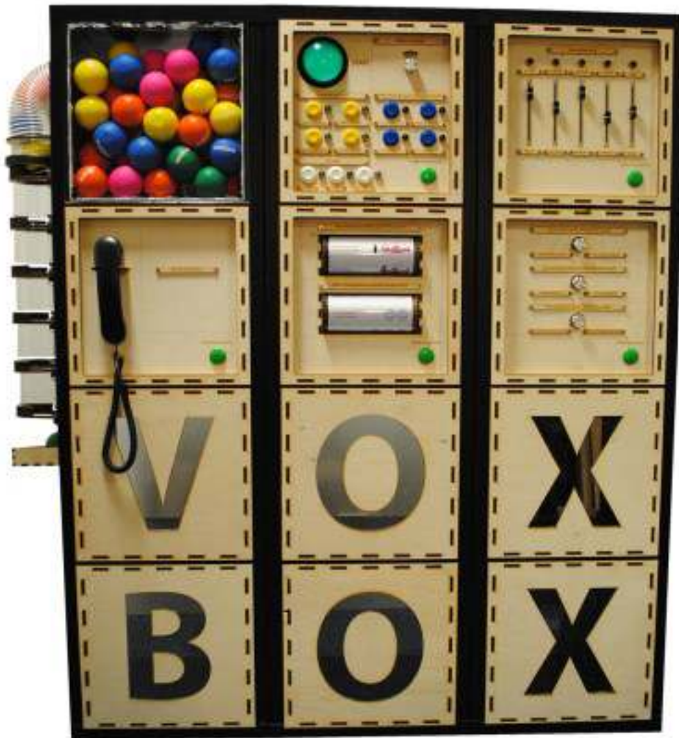
Figure 3. Voxbox.

data from the participant. In fact, the constellation is arguably too successful. The installation is so eye-catching that it draws interest quickly, but the time it takes people to complete the experience often results in long lines of participants waiting to take part.