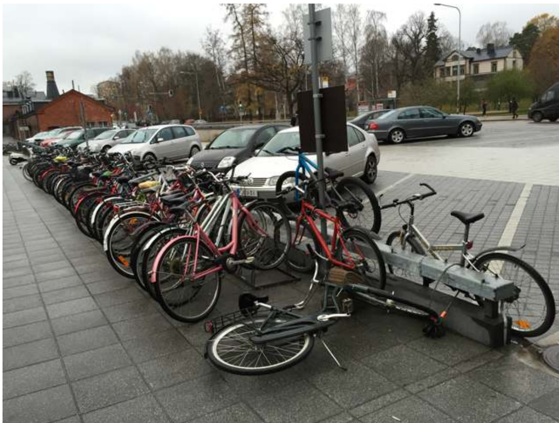
Figure 4. Fallen bike on the Arabia campus of Aalto University, Helsinki.

To explore how a design process could evolve if the design of a value constellation were the objective rather than a product or platform itself, the authors worked with members of a workshop at NordiCHI in 2014 to see what could be achieved.