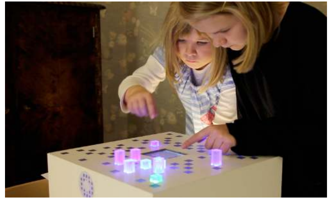
Figure 7. Manhattan prototype in use.

ware in order to deliver the desired visual and tangible result (see Figure 7).