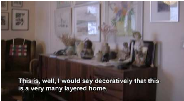
Figure 1. A screenshot of a Video Portrait.

Video portraits were co-authored with volunteers in different kinds of households in the Helsinki Metropolitan area. The participants were chosen from different areas and varying socio-economic backgrounds. They first documented their daily lives over a period of one week with a probe diary, which included questions and project-related design tasks. Then they were interviewed and recorded on video. During the interviews, the material landscape of the home was also documented. The video materials were edited into portraits that depicted one person at home. Five portraits, each approximately 45 minutes long, were prepared.