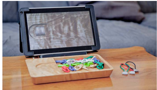
Figure 2. Tokens of Search prototype.

Tokens of Search is a system that transforms web links into physical forms. Central to the system are tangible handles, the tokens, which bring the web out of the virtual world into the physical landscape of the home. This system is the most open of the prototypes in its support for appropriation. The role of the system in the household can vary drastically, depending on the web links that people choose to use, whether they are shared with others, and where they are placed. Tokens may point to a single web page or a collection of links, may be left in various locations around the home, and the device itself may also be situated where household members desire, be this in a hallway, kitchen, or living room (see Figure 2).