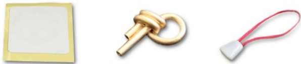
Figure 3. Three different tokens: sticker, knot, and bindable.

The simplicity of the original idea for Tokens of Search proved deceptive. Different implementations appeared to exclude important benefits of their alternatives. The first version of the prototype was designed to require an attached RFID reader. The association of web links with a token could be achieved only through physical interaction with the token. The requirement for having the RFID reader always available was considered problematic. Thus an alternative design was implemented. It was based on having a web browser that would function as a window to the links associated with a token. The design resulted in there being only one RFID reader at the tray. The system was designed to communicate with a dynamic website through a WebSocket delivering real-time feedback from the RFID reader. Many web browsers could be active at once and deliver the contents of an active token.