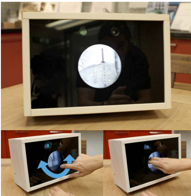
Figure 5. Hole in Space prototype and the tangible interactions enabled by the device.

Hole in Space creates a living connection from the home to a particular remote place that matters to the household members. These places, such as summer cabins and other locations with a strong personal bond, could be experienced through the device. The system creates an interactive visual stream from a webcam augmented by news headlines from distant-local news agencies and distant-local radio stations broadcasting through the web. Via its visual stream, Hole in Space conveys changes in daylight and weather thus allowing the household members to peripherally live with the distant place and experience how its overall atmosphere changes over time: the shines, storms, snows, and mists, as well as gradual seasonal changes in colour saturation.