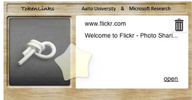
Figure 4. The graphical user interface of the resident Tokens of Search application on a user's computer.

web radio stations. Envisioned uses for the stickers included attaching these to holiday postcards, to support access to related blogs or journals created during a family trip. Other uses, such as sharing notes or files via tokens, which would require cloud implementation, were also considered.