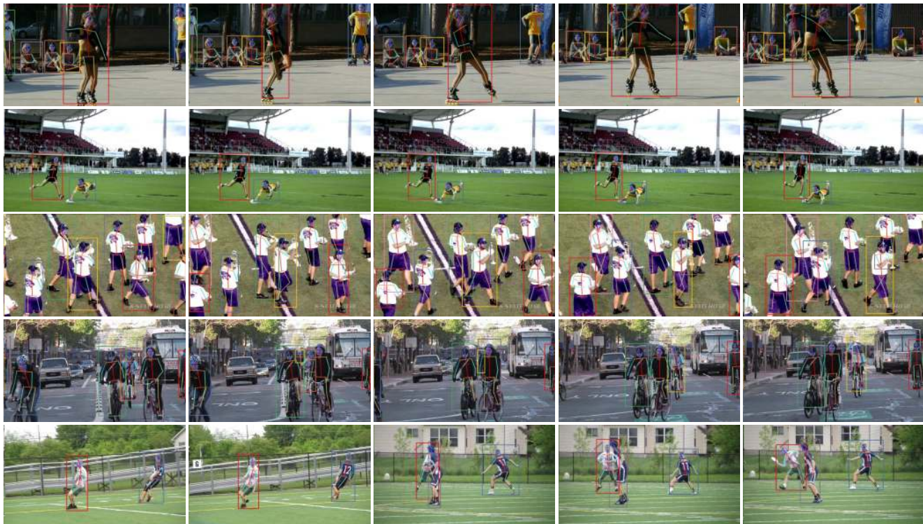
Figure 3. Sample results. Visualization of predictions from our two-stage model on the PoseTrack validation set. We show five frames per video, with each frame labeled with the detections and keypoints. The detections are color coded by predicted track id. Note that our model is able to successfully track people (and hence, their keypoints) in highly cluttered environments. One failure case of our model, as illustrated by the last video clip above, is loss of track due to occlusion. As the skate-boarder goes behind the pole, the model loses the track and assigns a new track ID after it recovers the person.

the test set (obtained from the evaluation server) to their performance in Table 5. Note that their reported performance in [26] was at PCKh0.34, and the PCKh0.5 performance was provided via personal communication. We note that while the numbers are not exactly comparable due to differences in the test set used, it helps put our approach in perspective to the state of the art IP based approaches. We also submitted our final model to the ICCV’17 challenge [1]. Our final MOTA performance on the full test set was 51.8, and out-performed all competing approaches submitted to the challenge. Fig. 3 shows some sample results of our approach.