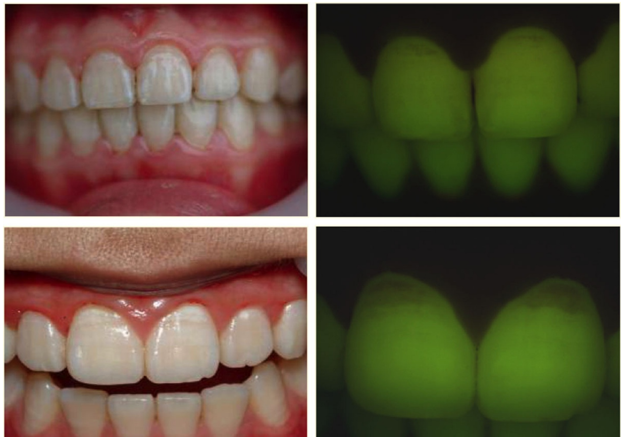
Figure 3 QLF clinical examples

Another emerging technology is the Canary Dental Caries Detection System. The technology is based on the detection of optical and thermal changes using a