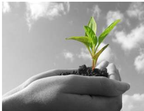
Figure 1.1: An illustration of the transactions that happen between nature and nurture of the student

The meaning of the transactional theory has been simplified in Figure 1 below which illustrates that the female student, from birth, brings in the nature (the DNA and genes) and then is planted and nurtured in a specific environment which influences the outcome of growth and performance (Seshamani & Shalumba, 2010:4; PDCE Admin, 2010:6). The transactional model describes development as the result of a complex interplay between the child and his/her natural environment, personality and traits, as well as family experiences and economic, social and community resources (PDCE Admin, 2010:4). The transaction that takes place determines the academic performance of the female student. This was the focus of this study.