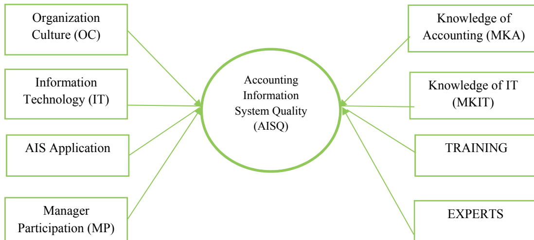
Fig. 1. Accounting information system quality research model

This paper studies the determinants of the quality of accounting information system. Research model is shown in Fig. 1.