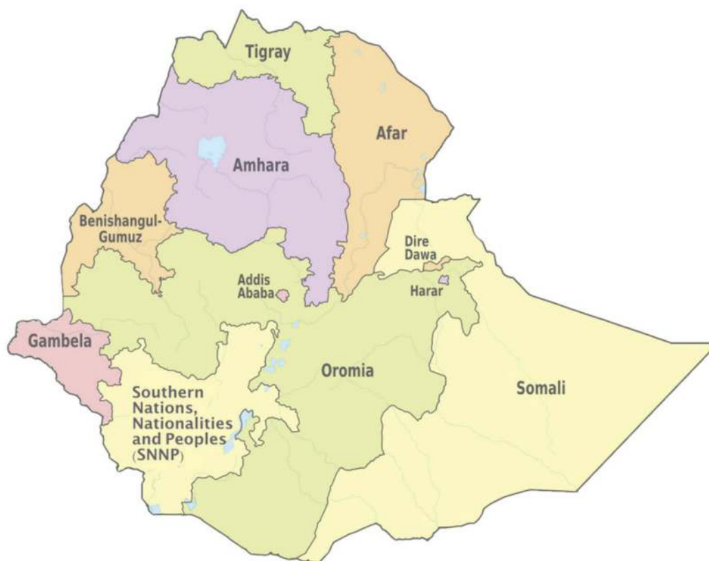
Figure 1 The maps of regional states in Ethiopia.

Despite various efforts made to prevent childhood diseases in Ethiopia, the prevalence has persisted since 2011. 4,21 Our findings showed that there is a huge disparity in the distribution of ARIs in children across the different regional states of Ethiopia. The highest prevalence of ARI, 16.8%,