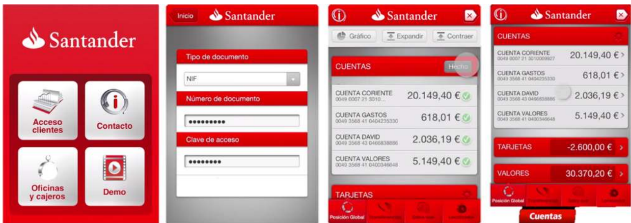
Figure 2 Video images shown to subjects.